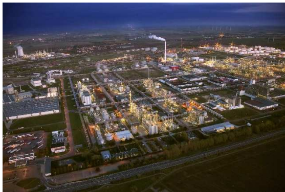
The Leuna chemical complex

Kraftanlagen, a subsidiary of Bouygues Construction in the Energies & Services division, has been chosen by InfraLeuna GmbH to lay the foundations for secure energy supply for the Leuna chemical complex, near Leipzig. The contract is worth more than €100 million for Kraftanlagen. This ambitious project follows on the commissioning in January 2020 of the Kiel coastal power plant, a highly flexible installation and a flagship project for the energy transition.