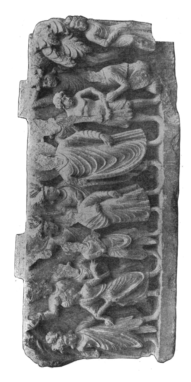
BUDDHIST CARVING FROM TAKHT-I-BAHI.