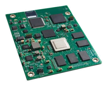
Figure 1. Cisco ESR6300 NCP model (no cooling plate)

Cisco has an ecosystem of partners and systems integrators that embed Cisco ESR6300s into industrystandard, commercially available enclosures as well as custom enclosures tailored to the unique environments in which these routers are deployed. Figures 1 and 2 show the Cisco ESR6300 NCP (no cooling plate) and ESR6300 CON (conduction-cooled) models, respectively.