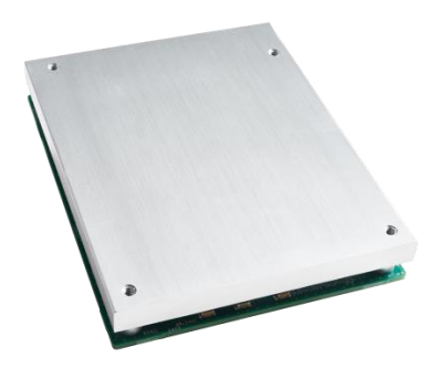
Figure 2. Cisco ESR6300 CON model (with cooling plate)