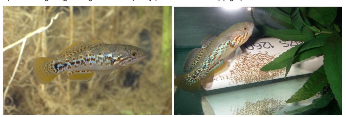
Figure 7 and 8: A Southern Purple Spotted Gudgeon (left) and a Southern Purple Spotted Gudgeon guarding larvae in captivity (right)