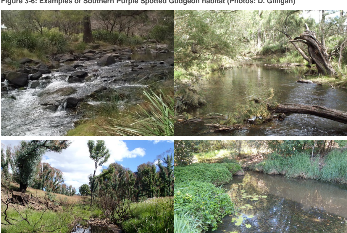
Figure 3-6: Examples of Southern Purple Spotted Gudgeon habitat