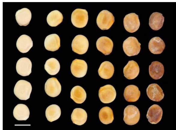
Figure 5: Phomopsis-infected broad-leaf lupin seed sorted into categories based on degree of discolouration. Seed was sorted into these categories (0 on left, 5 on right) and sown in a germination experiment

Delayed harvest may increase phomopsis infection if weather conditions are suitable. In years with dry summers lupins that are not harvested can generally be grazed safely, provided they have been inspected for signs of infection. In wet summers however, the risk of lupinosis occurring is greater.