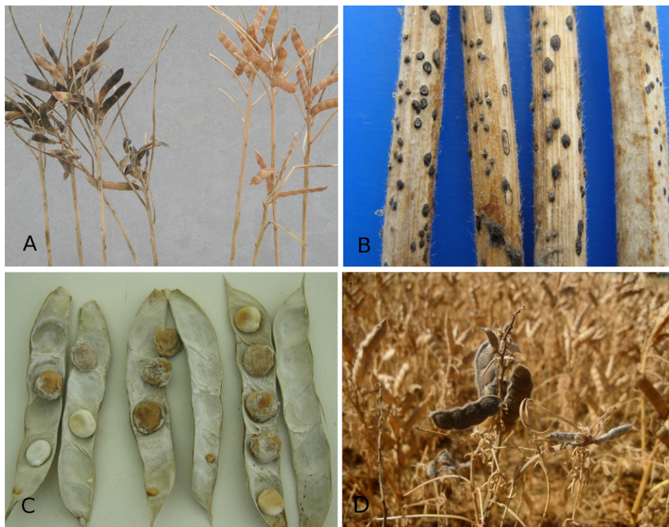
Figure 1: Effect of phomopsis on Albus lupins. A. Contrasting a resistant variety on right with a susceptible variety on the left. B. Characteristic pycnidia ("leopard" spotting) on L. albus stubble. Stems such as these will contain the toxins causing lupinosis. Infected stems look similar in both lupin species. C. Heavily infected pods and seeds from field grown plants after late season rain. D. An infected lupin plant prior to harvest following late season rain.

In the worst cases lupinosis can cause deaths but commonly results in weight loss as sheep lose their appetite. In late pregnant ewes this may result in pregnancy toxemia. Wool growth and staple strength may also be reduced while twinning and conception rates may be significantly reduced.