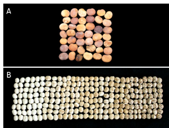
Figure 2. A; Phomopsis infected Narrow-leaf lupin seed. Note the golden-tan colour, see Figure 5 for Albus lupin. B; The range in seed mottling between different varieties of Narrow-leaf lupin can make it difficult to detect Phomopsis infected seed. Bar = 10mm.

Animals suffering these effects of lupinosis are likely to perform poorly or have photosensitisation for some weeks after grazing lupin stubbles. Some die as liver damage progresses.