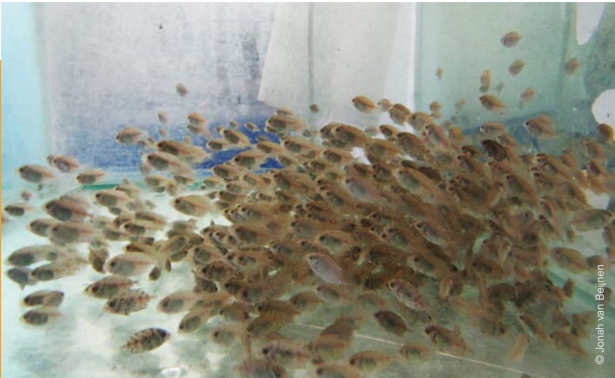
Juvenile rabbitfish bred at a hatchery in Palawan, the Philippines