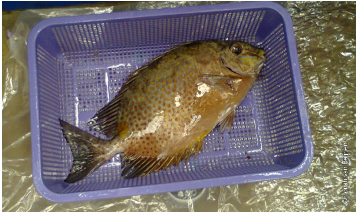
Wild-caught broodstock of goldlined spinefoot rabbitfish ( Siganus guttatus )