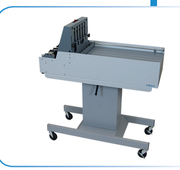
Optional V-Stack36 Vertical Stacker with adjustable-height stand