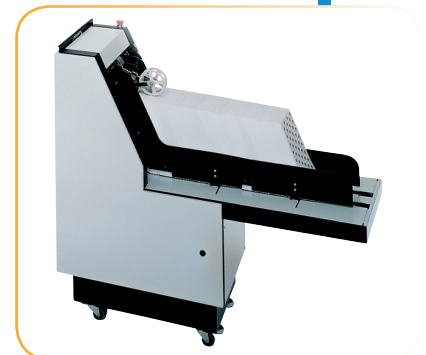
FD 2000-60 Bulk Input Loader