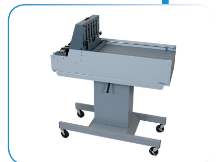
Optional V-Stack36 Vertical Stacker with adjustable-height stand