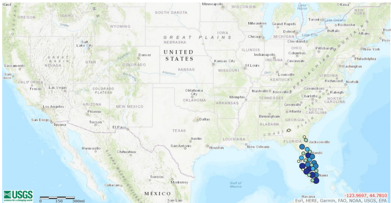
Figure 2. Known distribution of Hoplosternum littorale in the United States. Locations are in Florida and Georgia. Map from Nico et al. (2019). It is unknown if the observation in Georgia is representative of an established population so it was not used to select source points for the climate match.