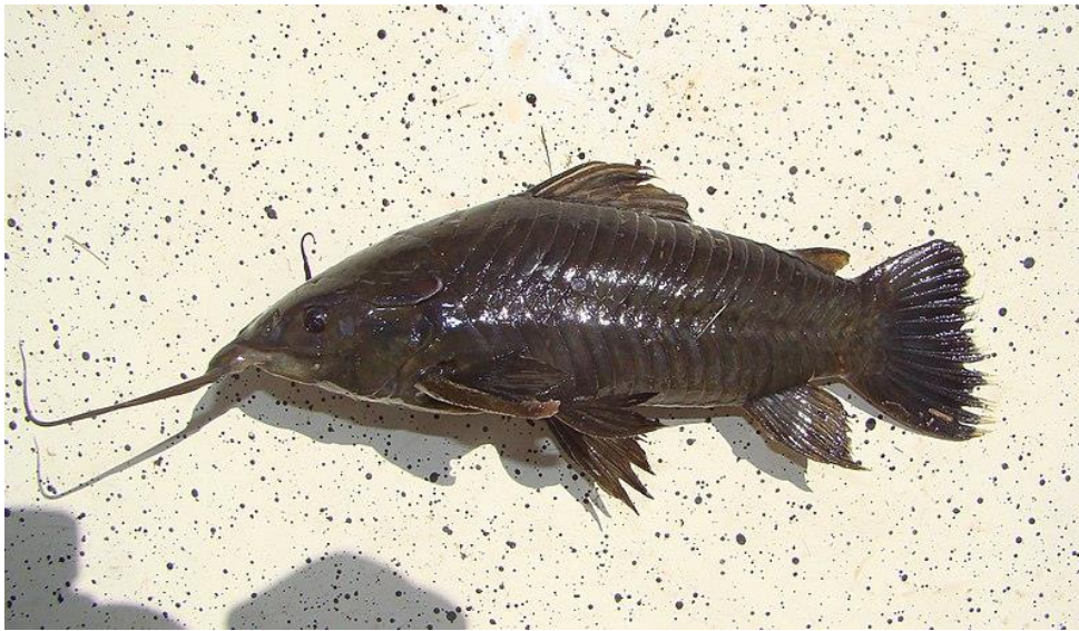
Photo: Cláudio Dias Timm. Licensed under Creative Commons Attribution- ShareAlike 2.0 Generic License. Available: https://fr.wikipedia.org/wiki/Fichier:Hoplosternum_littorale.jpg . (July 2019).

U.S. Fish & Wildlife Service, July 2019 Revised, July 2019 Web Version, 11/13/2019