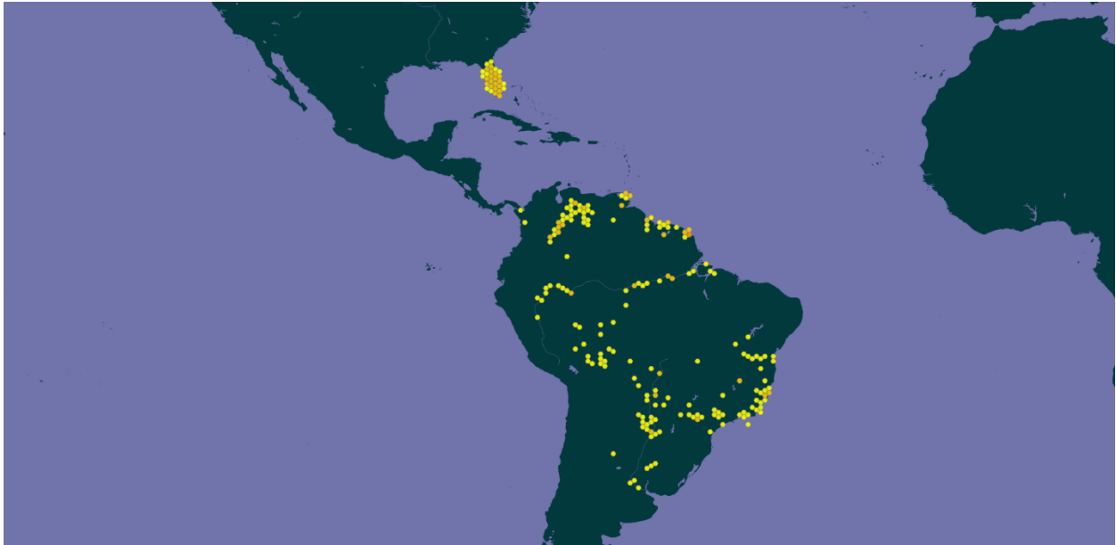
Figure 1. Known global distribution of Hoplosternum littorale . Locations are found in Florida, Colombia, Venezuela, Guyana, Suriname, French Guiana, Brazil, Peru, Bolivia, Paraguay, Argentina, and Uruguay. Map from GBIF Secretariat (2019).