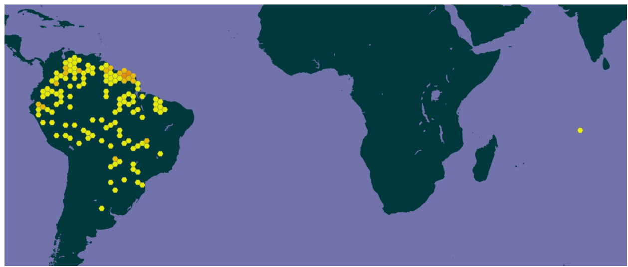
Figure 1 . Known global distribution of Pimelodus ornatus . Observations are reported from South America. Map from GBIF Secretariat (2022). The location in the Indian Ocean has incorrect coordinates and therefore was not included in the climate matching analysis.