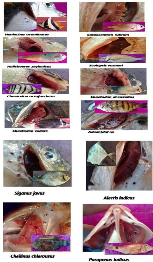
Figure 2: Gnathia sp in the gill chamber of coral reef fishes from South-east coast of India