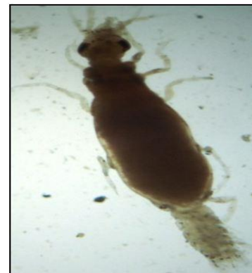
Figure 2: Dorsal view of Gnathia sp.

During the investigations on gnathia sp isopod were found in the gill chamber of coral reef fishes (Figure 2).