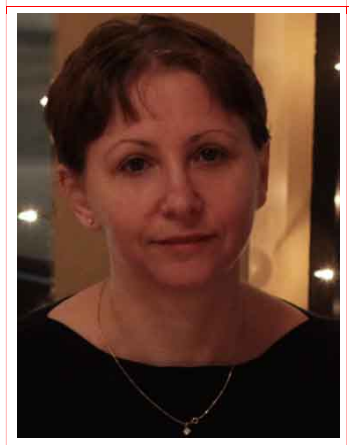
Topic: Interactive Art