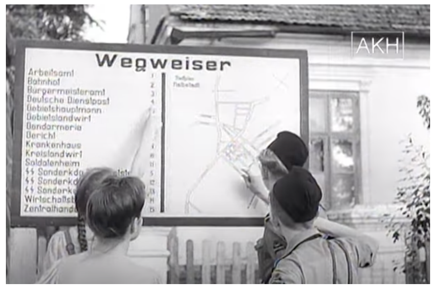
Guide and Map for Halbstadt<sup>51</sup>

before the arrival of the Germans." Stunningly, Gerlach adds that this opinion "concurs with that of many others." 50