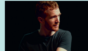
Why We Fight © Sebastien de Buyl