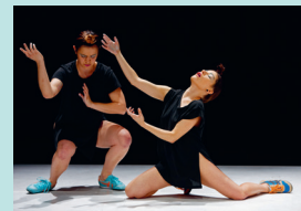
BLINK - mini unison intense lamentation © Thomas Lender