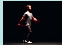
Time to Time

So, 11. August, 21:00 Kasino am Schwarzenbergplatz Eintritt frei mit Zählkarte