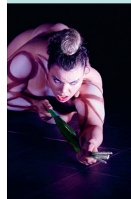
HATE ME, TENDER