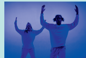
SOFTLAMAutonomies © Ian Douglas