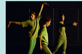
'd he meant vary a shin's © Jose Figueroa