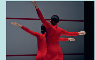
SUASH

So, 11. August, 21:00 Kasino am Schwarzenbergplatz Eintritt frei mit Zählkarte