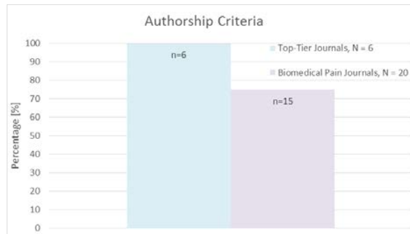
Fig 1. The % of journals which state authorship criteria