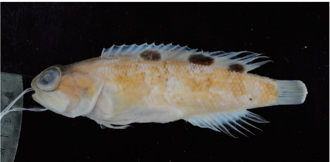
Fig. 2. Opistognathus trimaculatus sp. nov., NSMT-P 111154, holotype (in preservation), 72.0 mm SL, female, off Kochi City, Tosa Bay, Japan.