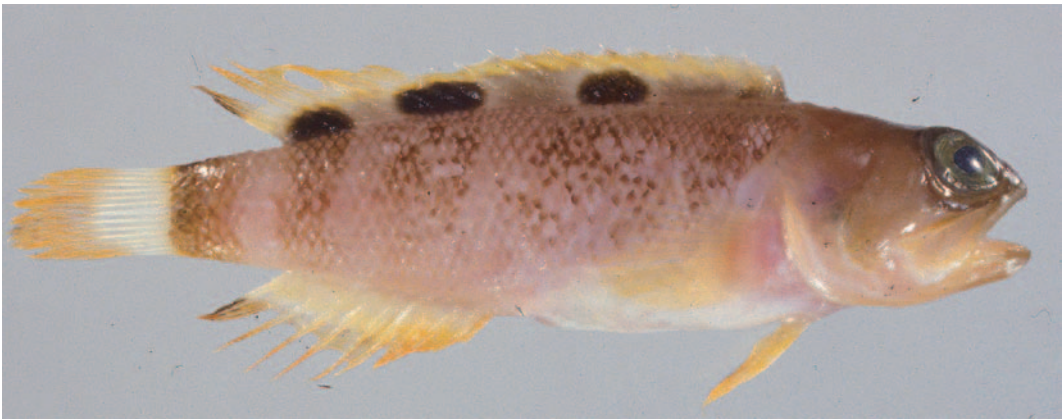
Fig. 1. Opistognathus trimaculatus sp. nov., NSMT-P 111154, holotype (in fresh), 72.0 mm SL, female, off Kochi City, Tosa Bay, Japan.

Paratype. BSKU 37494, 67.8 mm SL, 82.7 mm TL, female, Mimase fish market, Kochi