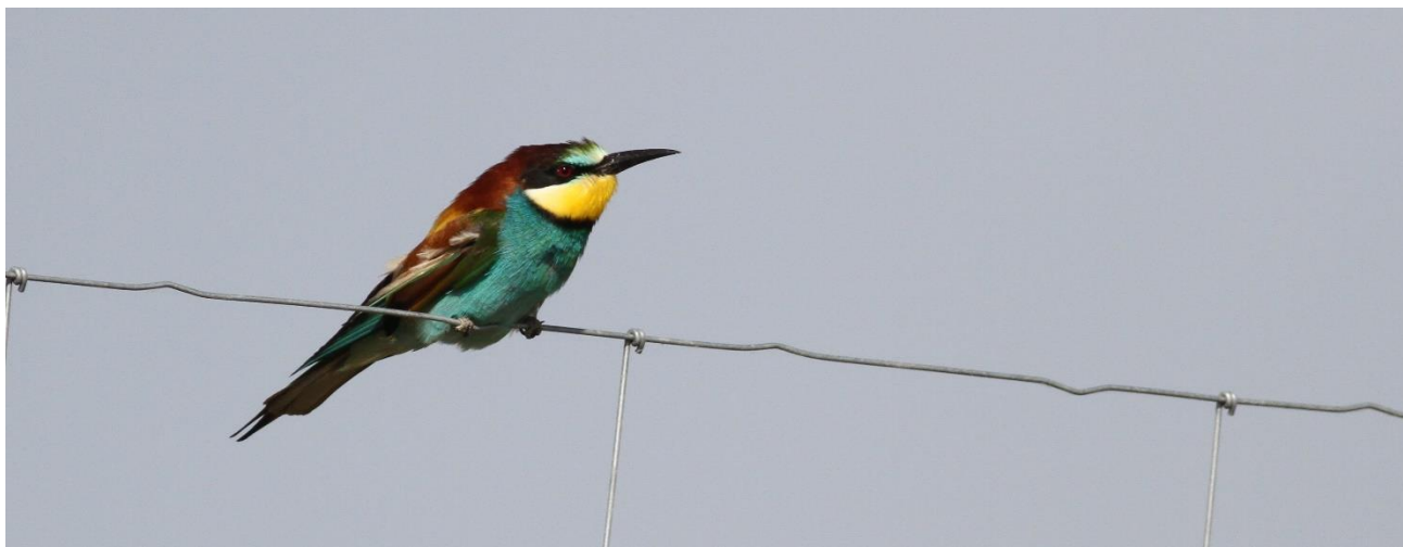
European Bee-eater should be a regular feature of our Cyprus holiday

Overnight falls can also bring several races of Yellow Wagtails, including the lovely Black-headed. The rugged limestone outcrops attract the handsome Blue Rock Thrush and passage waders can sometimes include Greater Sand Plover in smart breeding plumage.