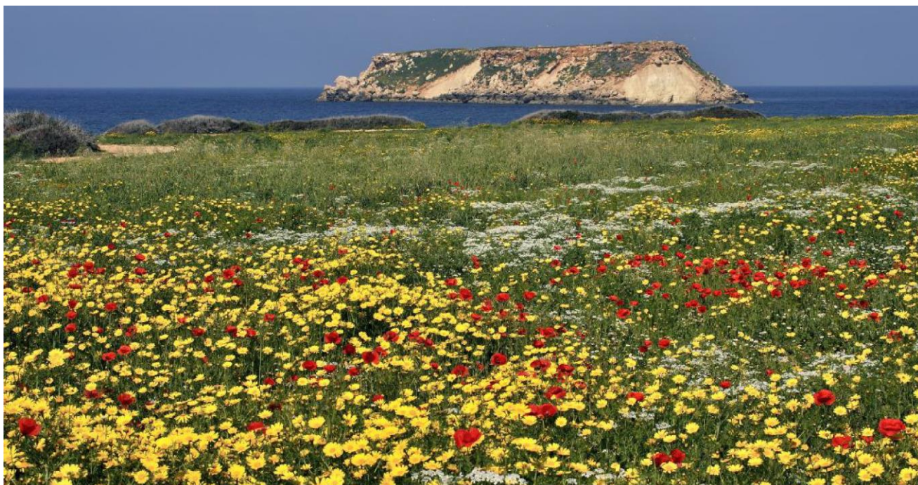
Spring wildflowers at Cape Drepanum, looking towards Yeronissos Island

Offshore, we may spot parties of Yelkouan Shearwaters drifting by, or marvel as flocks of migrating Black-crowned Night and Squacco and Purple Herons pass by. If we are lucky, rarities may drop in and our March 2019 group, for example, saw both Hooded Wheatear and Caspian Stonechat here!