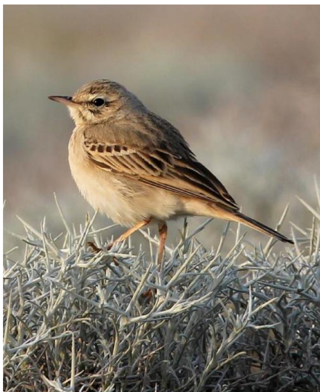
Migrant Tawny Pipit

Weather permitting, we will travel up into the spectacular Troodos Mountains. In late March, they can still have snow on their upper slopes and one could almost forget that this is the Mediterranean as the road winds ever higher through extensive forests of Calabrian and Black Pine. While the scenery would be reason enough to visit, these beautiful mountains are home to a number of birds that have evolved distinctive isolated populations: 'chocolate' Coal Tits, dusky-headed Jays and large-billed Red Crossbills await, along with 'Cyprus' Short-toed Treecreeper and a number of other endemic or near-endemic races of otherwise familiar birds.