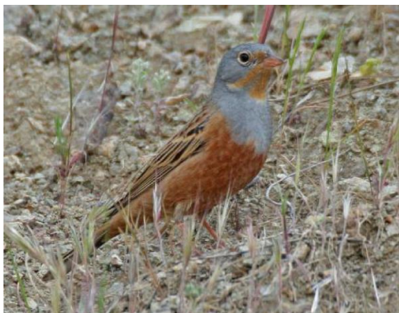
Male Cretzschmar's Bunting, Paphos