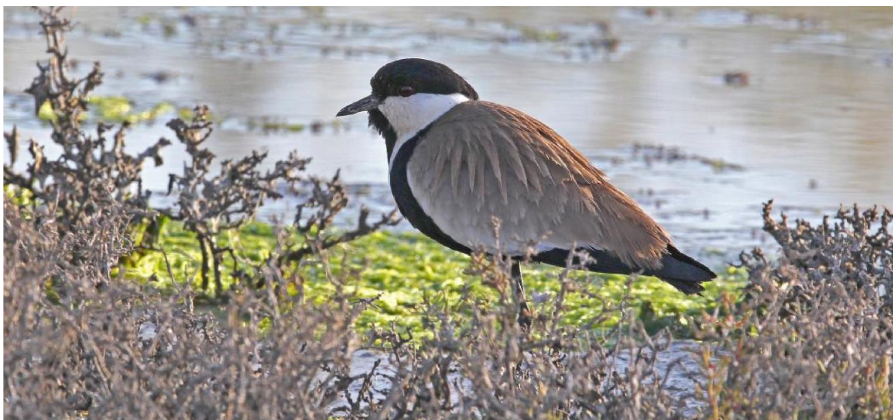
The localised Spur-winged Lapwing breeds at the Oroklini wetlands

Limosa first visited Cyprus in 1999 and we have been lucky to see many superb birds there over the years. Our March 2022 tour will be guide Gary Elton's fourth visits to the island for Limosa so why not join him for all the excitement of a spring migration tour with more than a hint of the Middle East.