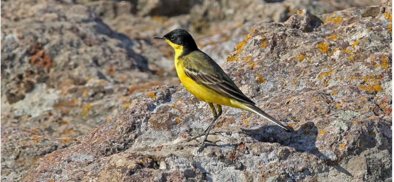
Overnight falls can bring several races of Yellow Wagtails, including the lovely Black-headed

Saturday 26th March - Saturday 2nd April (8 days) Single-centre, small group tour with Gary Elton