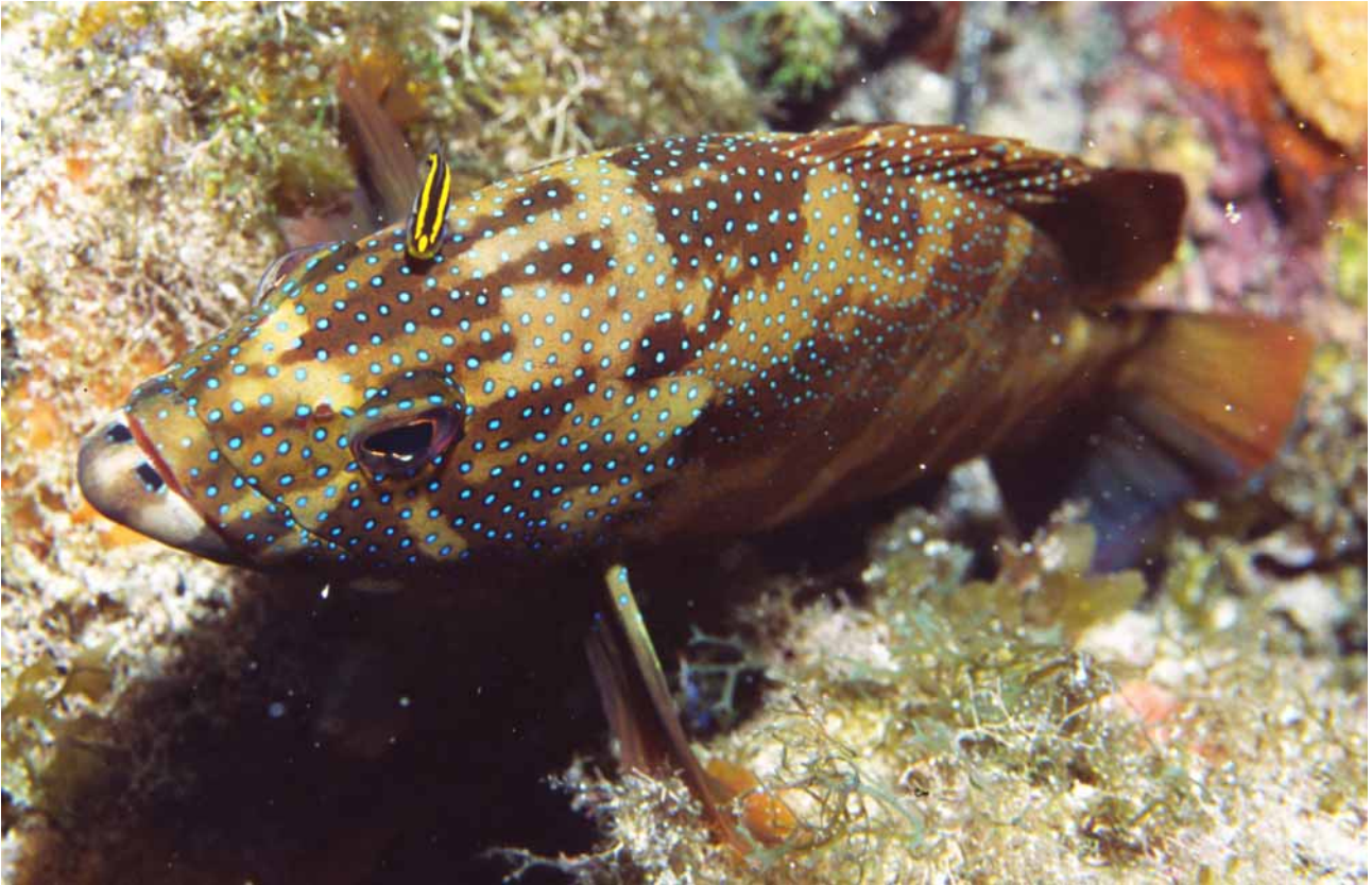
FIGURE 4: Elacatinus phthirophagus sp. n. cleaning the head of the grouper Cephalopholis fulva , near a cleaning station on rocky substrate covered with incrusting algae and sponges.

The new species increases to three the number of cleaner gobies known in Southwestern Atlantic, one from the coast and two from oceanic islands (Sazima et al. 1997, Guimarães et al. 2004, present paper). The recently described, oceanic Elacatinus pridisi (Guimarães et al. 2004) likely belongs in the “ randalli-evelynae ” cleaning clade ( sensu Taylor & Hellberg 2005) as well. Additionally, we suggest that Elacatinus phthirophagus sp. n. from Southwestern Atlantic and E. randalli from Northwestern Atlantic may be sister taxa.