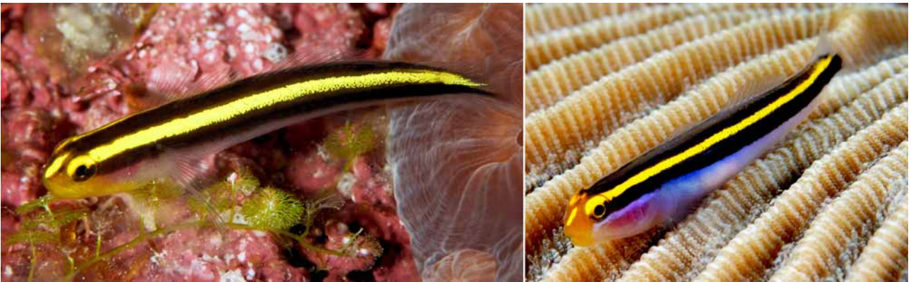
FIGURE 3: Elacatinus phthirophagus sp. n. (left) and Elacatinus randalli (right) in natural habitats, showing differences in width of yellow lateral stripe, pigmentation on snout, and absence versus presence of blue line extending from below eye to end of opercular margin (Photograph on left by J. P. Krajewski, that on right by L. A. Rocha).

Color pattern: bright yellow postocular stripe extending to the middle of caudal-fin (Figure 2); bright yellow elliptical spot on blackish snout (the latter less pigmented in small juveniles); upper portion of eye bright yellow and lower part black; black lateral stripe from lower half of eye's posterior edge to the middle of caudal-fin and more or less coincident with lateral septum (fading towards the end of caudal-fin); black dorsal stripe from middle of interorbital space extending in a curve to the anterior third of caudal-fin (in some large specimens the anterior part of this stripe is divided by a paler, grayish stripe); lower jaw and belly whitish, the anterior third of belly with a light purplish sheen; cheek and lower part of operculum to preoperculum rosy with purplish sheen; dorsal, pectoral and anal-fins, and outer border of caudal-fin pale with scattered dark chromatophores; pelvic-fin pale with no or fewer scattered chromatophores. In preservative (formalin or ethanol) the bright yellow color fades to yellowish light gray, and the rosy and purplish sheens disappear.