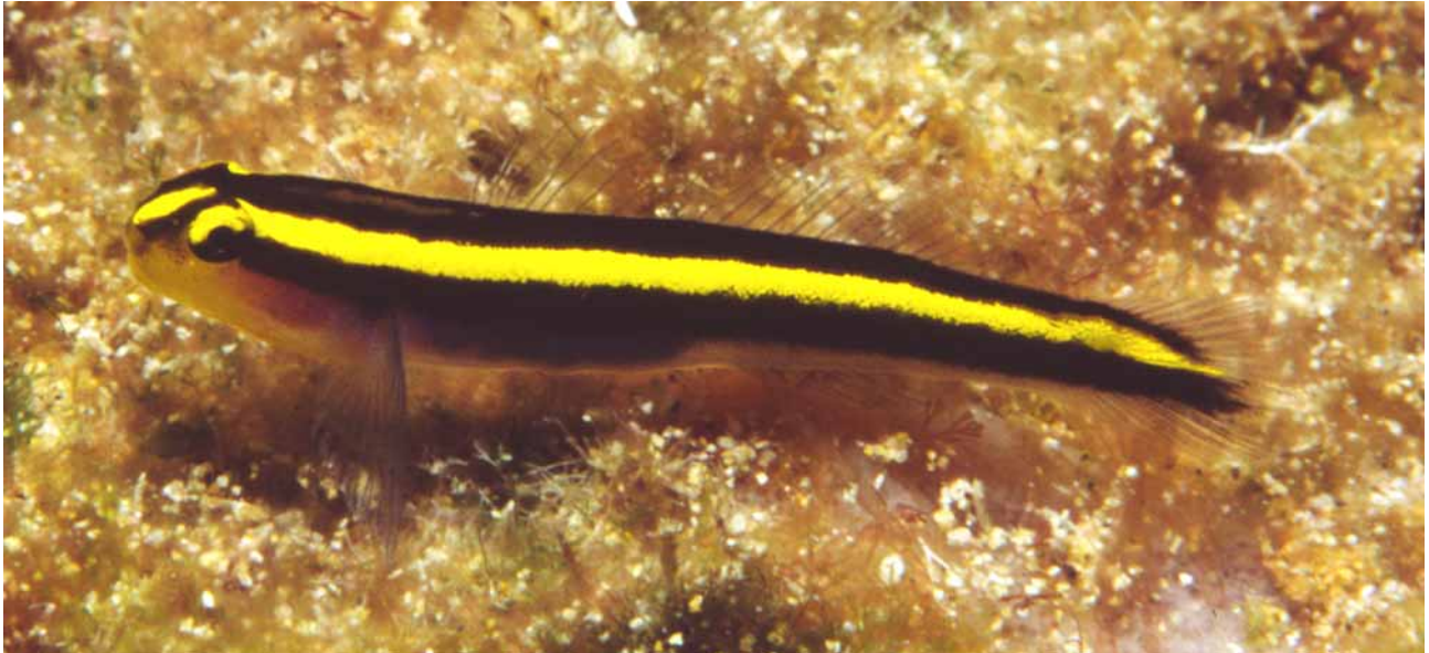
FIGURE 2: Elacatinus phthirophagus sp. n., adult individual in natural habitat, showing dark snout and lateral bright yellow stripe.

32°25'W), collected by R. B. Francini Filho, R. L. Moura & L. F. Mendes, 8 June 1998; ZUEC 3318 (1 ind., 23.6 mm SL, female), Ilha da Rata, Fernando de Noronha Archipelago (03°50'S, 32°25'W), collected by L. F. Mendes, 24 November 1996; CIUFES 0893 (2 ind., 17.0–21.5 mm SL, females), Porto de Santo Antonio, Fernando de Noronha Archipelago (03°50'S, 32°25'W), collected by I. Sazima & C. Sazima, 19 October 2004.