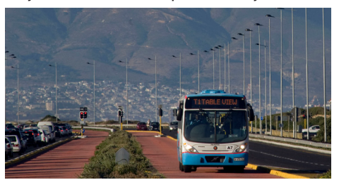
Dedicated lanes reduce time spent travelling.