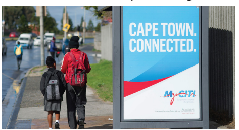
New pavements and street lights make it safer.