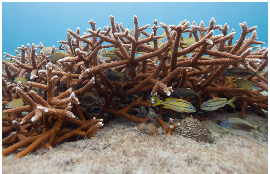
Healthy wild staghorn coral colony