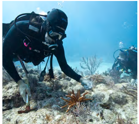
Coral Restoration Foundation divers check up on staghorn corals restored to a Keys reef