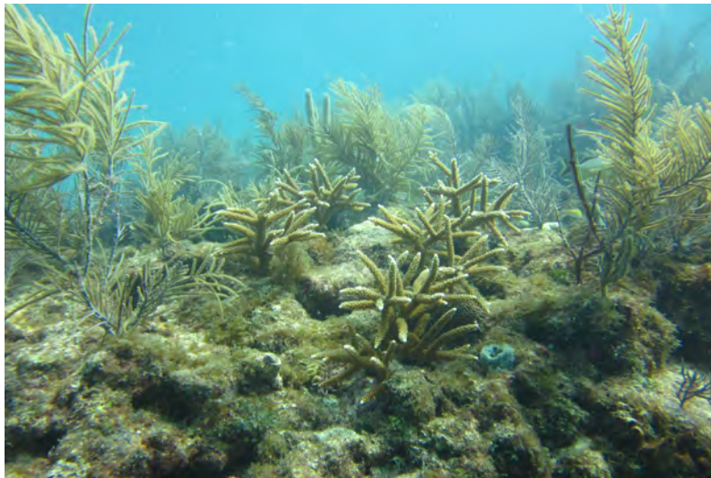
Restored staghorn corals after one year on the reef