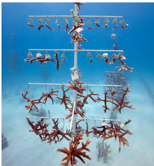
A coral 'tree' in the Coral Restoration Foundation nursery

Tens of thousands of staghorn corals are being grown and propagated in underwater nurseries, and then outplanted to degraded reefs off Monroe County. The project's primary restoration and recovery approach is to take small fragments of live tissue from healthy coral colonies of known genetic stock, grow them in nurseries over time to create multiple colonies of each genetic type, and then outplant genetically distinct individuals in proximity to one another so they spawn and help reseed surrounding reefs. Each outplanting site directly enhances live coral cover, wave-breaking structure, fisheries habitat and tourism value. Nearly 10,000 colonies have been reestablished on reefs since 2004, with first-year survival rates for these corals averaging above 80%.