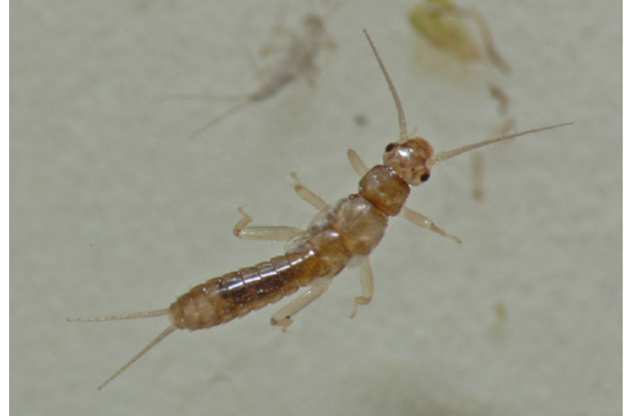
Snowfly Stonefly larva (Capniidae)