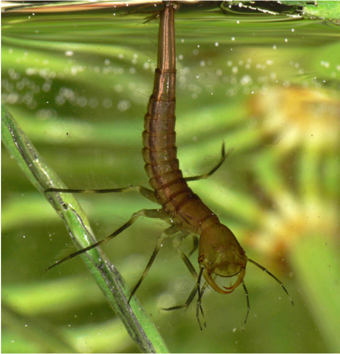
Predacious Diving Beetle larva (Dytiscidae)