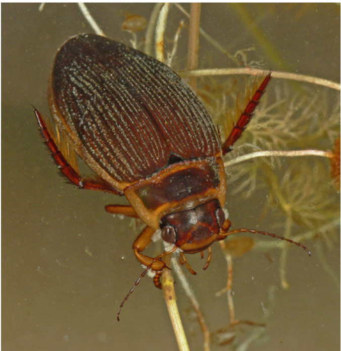
Predacious Diving Beetle adult (Dytiscidae)