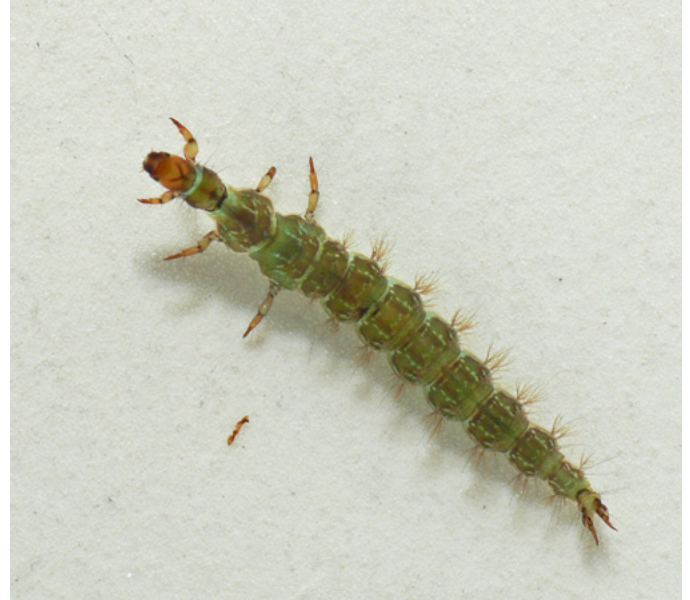
Green Rock Worms (Rhyacophilidae)