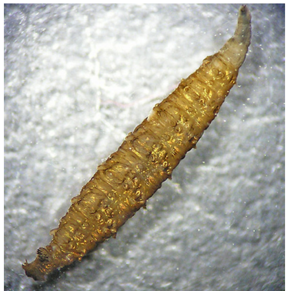
Snail-killing Fly larva (Sciomyzidae)