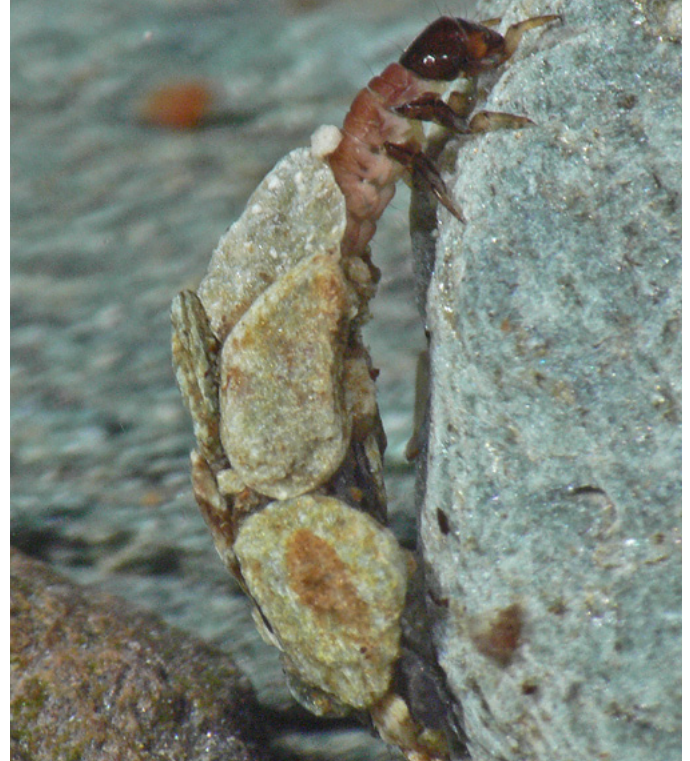
Tortoise-case Makers (Glossosomatidae)