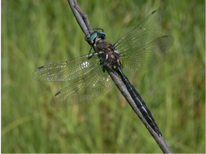
Emerald adult (Corduliidae)