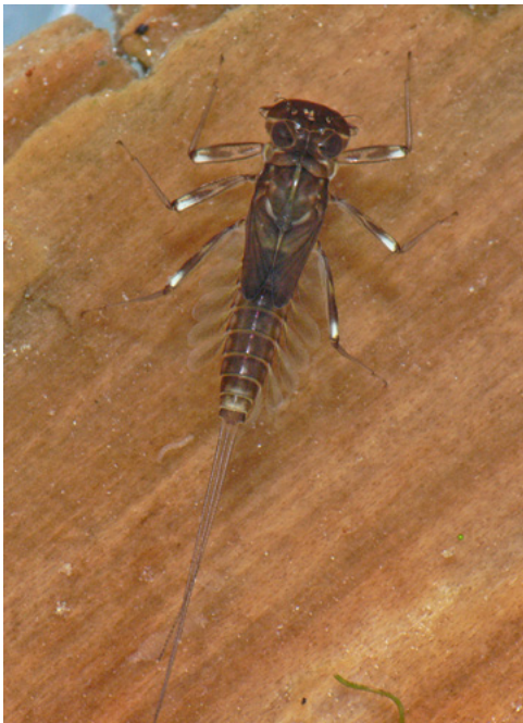
Flatheaded Mayfly larva (Heptageniidae)