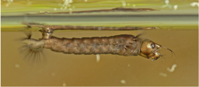
Phantom Midge larva (Chaoboridae)