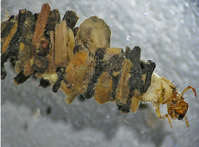
Lepidostomatid Case Makers (Lepidostomatidae)