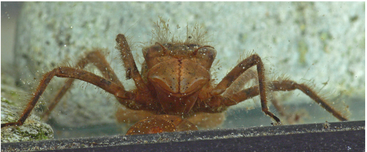
Skimmer Dragonfly larva (Libellulidae)