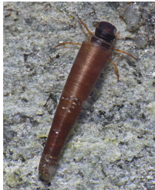
Humpless Case Makers (Brachycentridae)