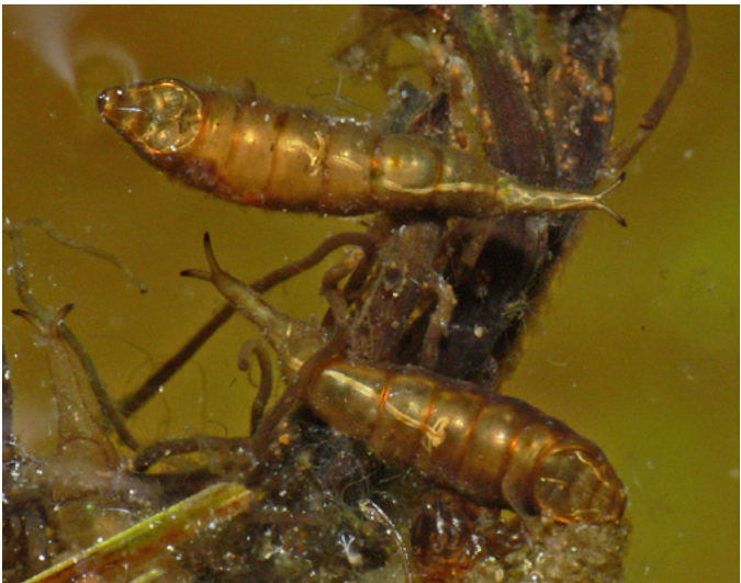
Shore Fly pupae (Ephydriidae)