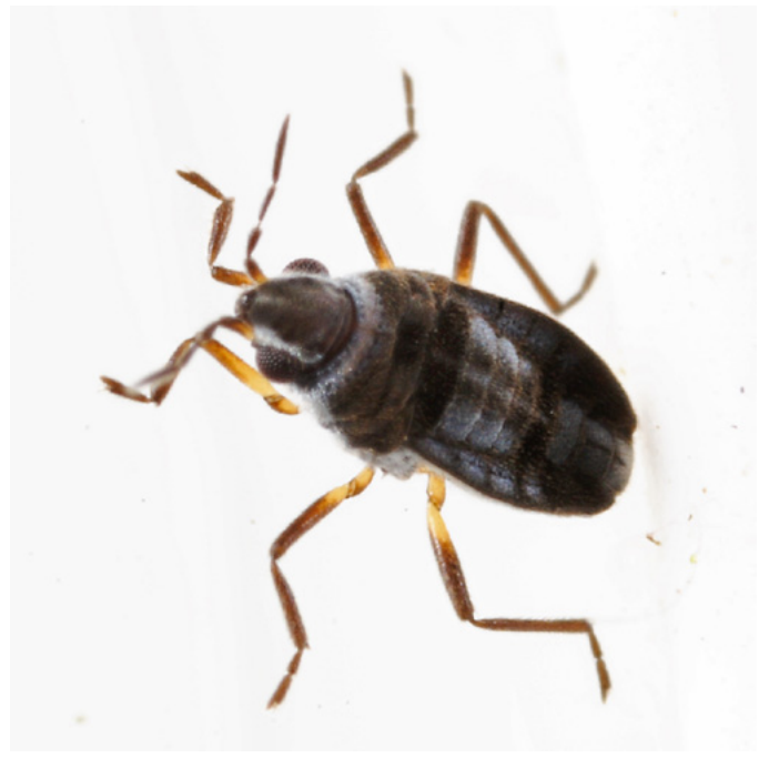
Shortlegged Strider adult (Veliidae)