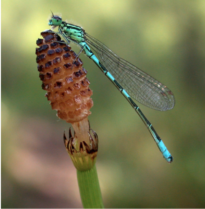
Pond Damsel Damselflies (Coenagrionidae)