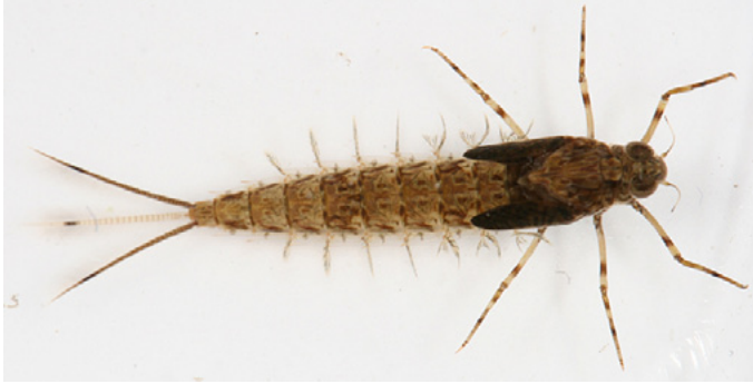
Cleftfooted Minnow Mayfly larva (Metretopodidae)