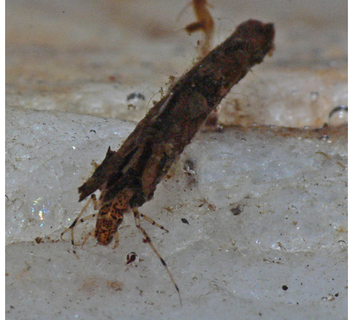
Longhorned Case Makers (Leptoceridae)