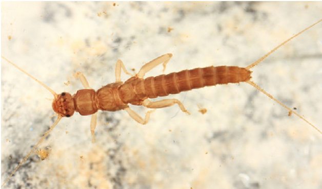
Needlefly Stonefly larva (Leuctridae)