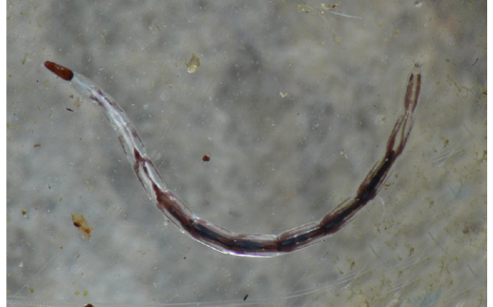
Biting Midge larva (Ceratopogonidae)