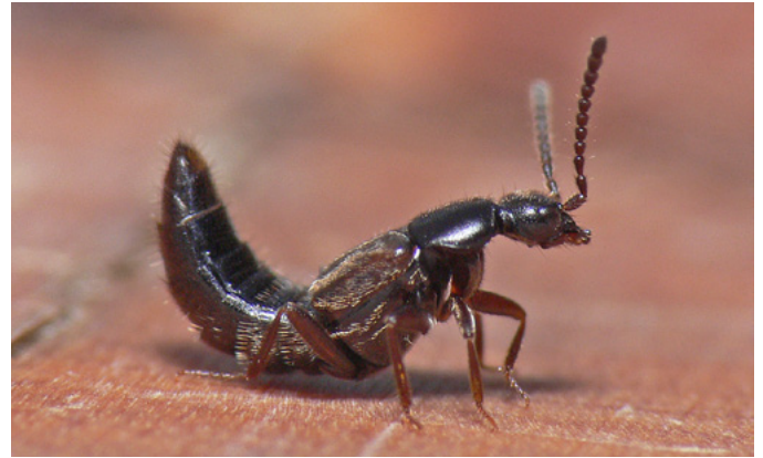
Rove Beetle adult (Staphylinidae)