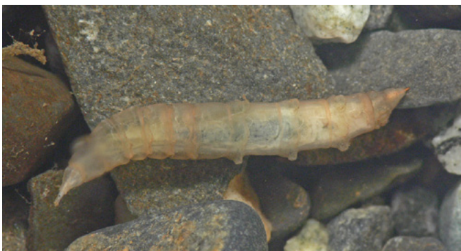
Horse and Deer Fly larva (Tabanidae)