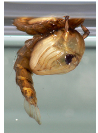
Mosquitoe larva (left) & Pupa (right) (Culicidae)