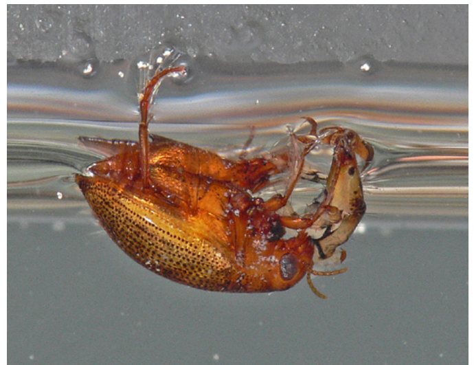
Crawling Water Beetle adult (Haliplidae)