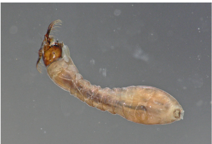
Black Fly larva (Simuliidae)