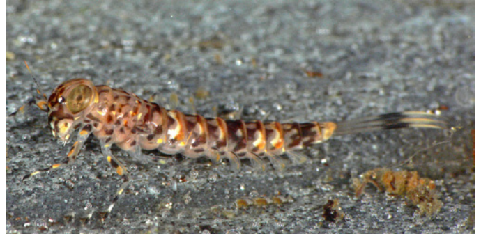
Combmouthed Minnow Mayfly larva (Ameletidae)