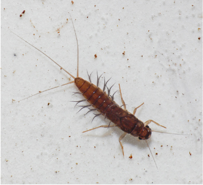
Prongbill Mayfly larva (Leptophlebiidae)