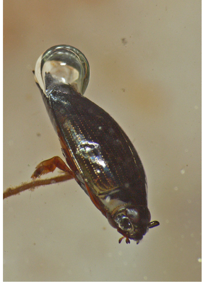
Whirligig Beetle adult (Gyrinidae)