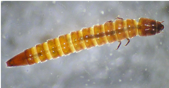
Riffle Beetle larva and adult (Elmidae)