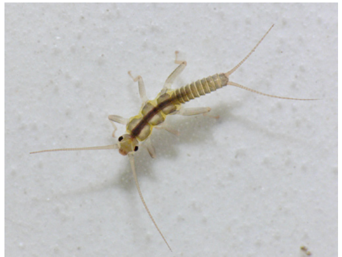
Willowfly Stonefly larva (Taeniopterygidae)