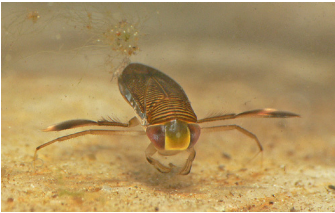
Water Boatmen adult (Corixidae)