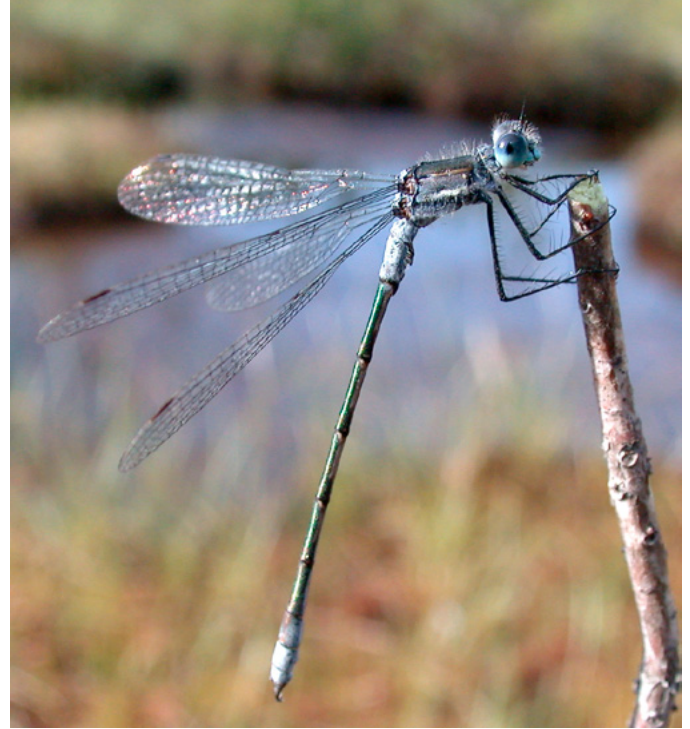
Spread-winged Damselflies (Lestidae)