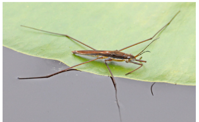
Water Strider adult (Gerridae)