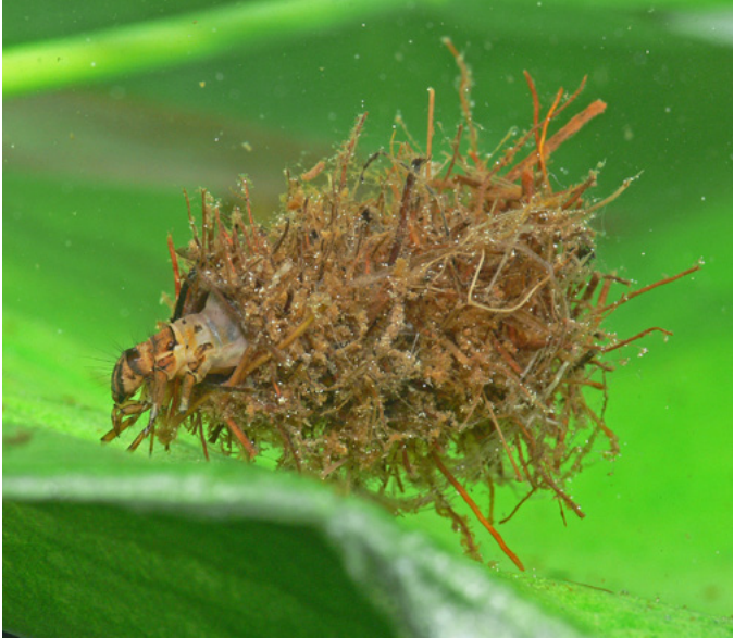
Giant Case Makers (Phryganeidae)