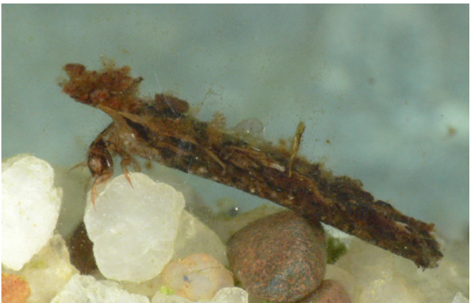
Hoodcase Makers (Molannidae)