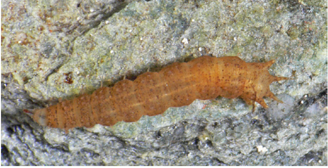
Aquatic Dance Fly larva (Empididae)