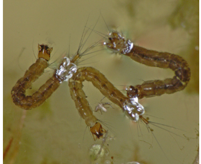
Dixid Midge larva (Dixidae)