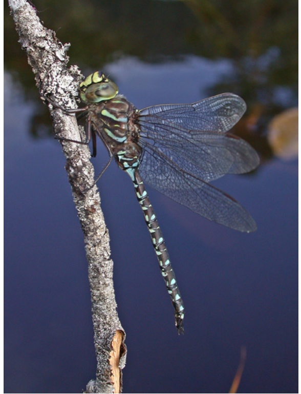
Mosaic Darner adult (Aeshnidae)