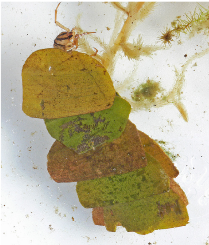
Northern Case Makers (Limnephilidae)