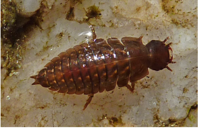
Trout-Stream Beetle larva (Amphizoidae)