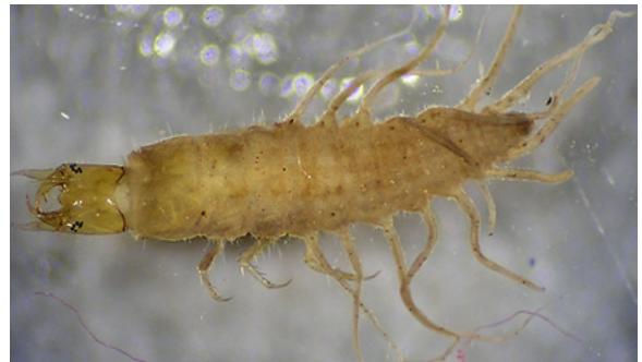
Water Scavenger Beetle larva (Hydrophilidae)