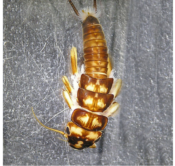
Golden Stonefly larva (Perlidae)