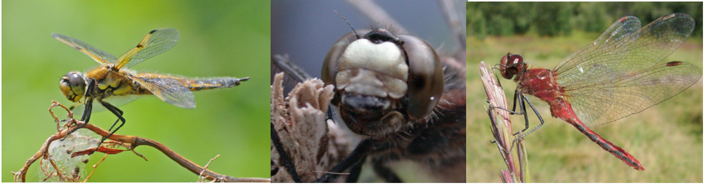
Skimmer Dragonfly adults (Libellulidae)