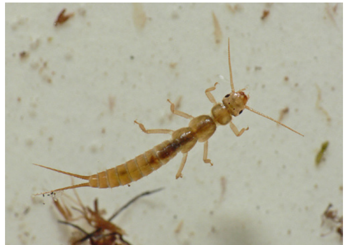
Sallfly Stonefly larva (Chloroperlidae)