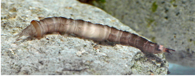
Crane Fly larva (Tipulidae)