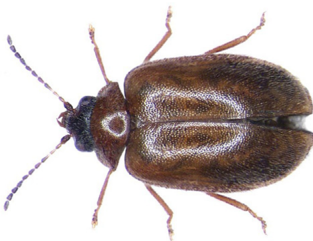
Marsh Beetle adult (Scirtidae)