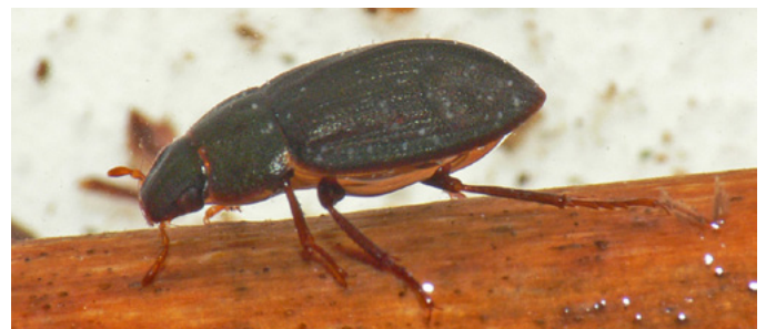
Water Scavenger Beetle adult (Hydrophilidae)