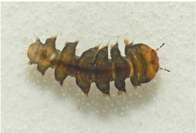
Net-winged Midge larva (Blephariceridae)