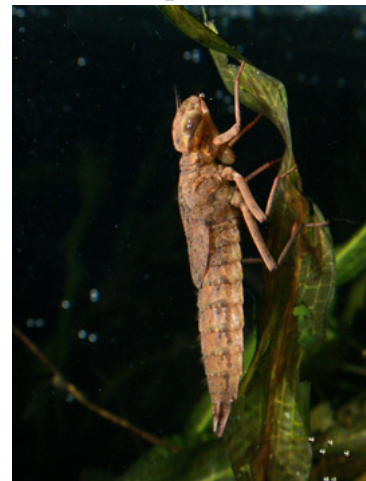
Mosaic Darner larva (Aeshnidae)