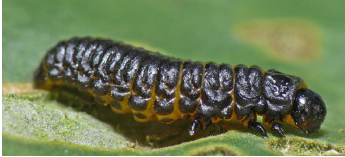
Aquatic Leaf Beetle larva (Chrysomelidae)