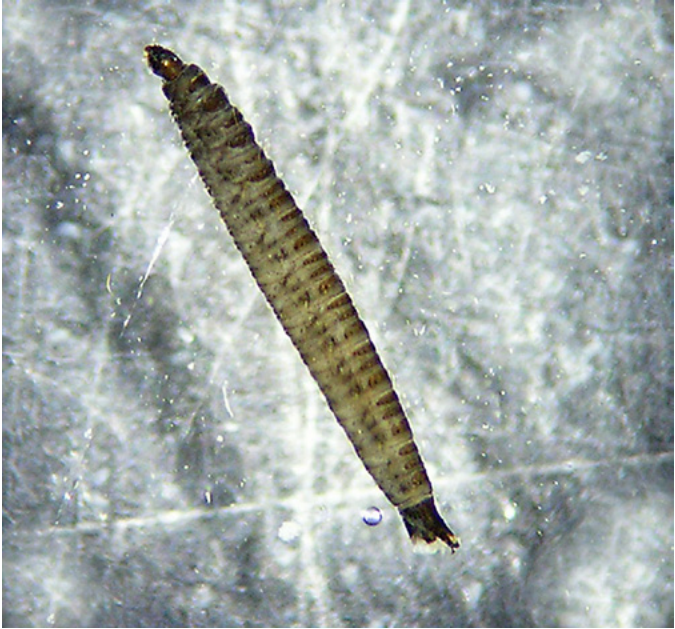
Moth Fly larva (Psychodidae)