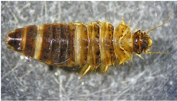
Marsh Beetle larva (Scirtidae)