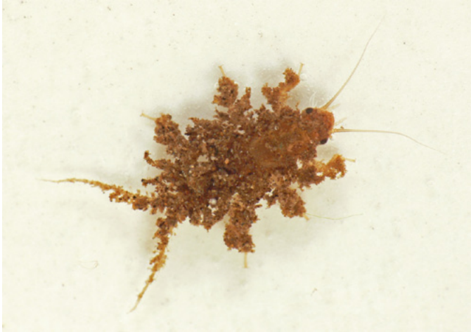
Forestfly Stonefly larva (Nemouridae)