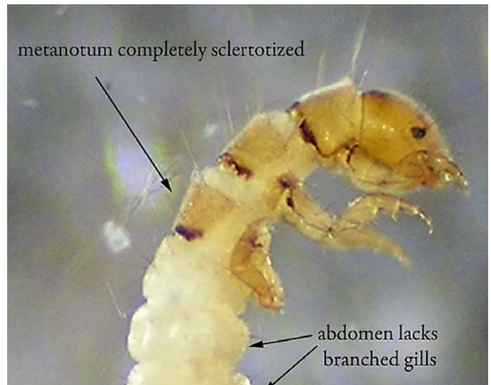
Purse-case Makers (Hydroptilidae)