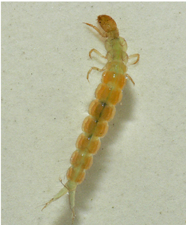
Tube-making Caddisflies (Polycentropodidae)