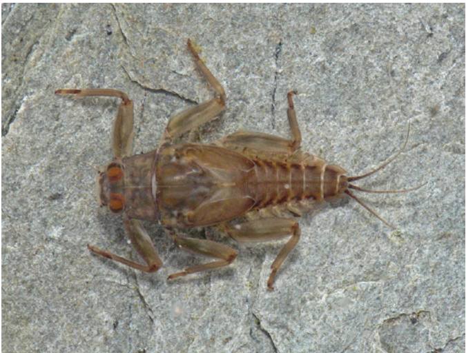
Spiny Crawler Mayfly larva (Ephemereliidae)