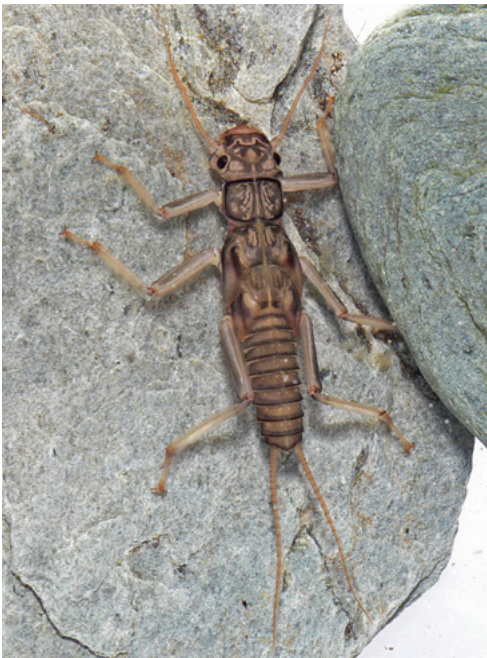
Stripetail Stonefly larva (Perlodidae)