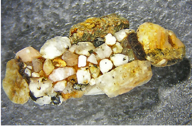
Stone-cased Caddisflies (Uenoidae)