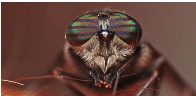
Horse and Deer Fly adult (Tabanidae)