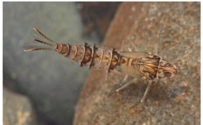
Primitive Minnow Mayfly larva (Siphonuridae)