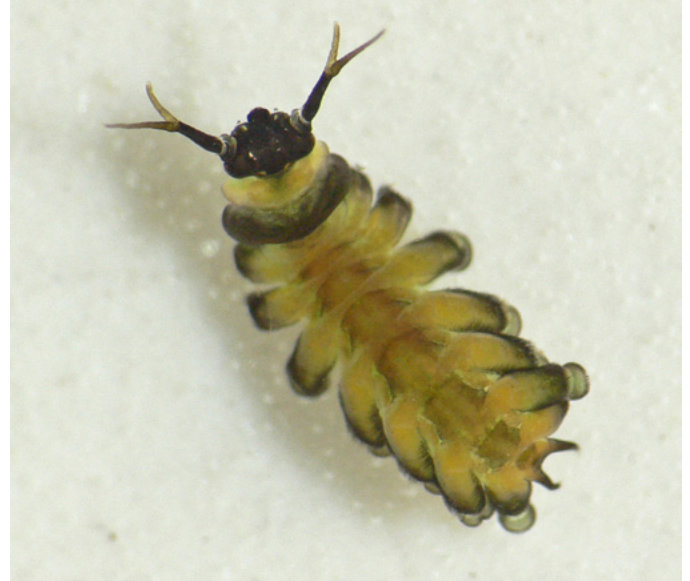
Mountain Midge larva (Deuterophlebitidae)