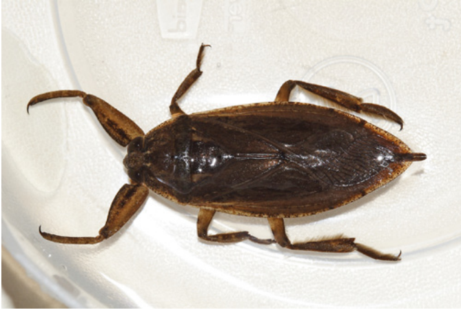
Giant Water Bug adult (Belostomatidae)