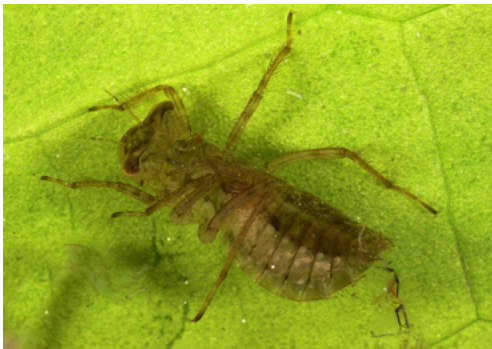
Emerald larva (Corduliidae)