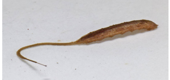
Rattailed Maggot larva (Syrphidae)