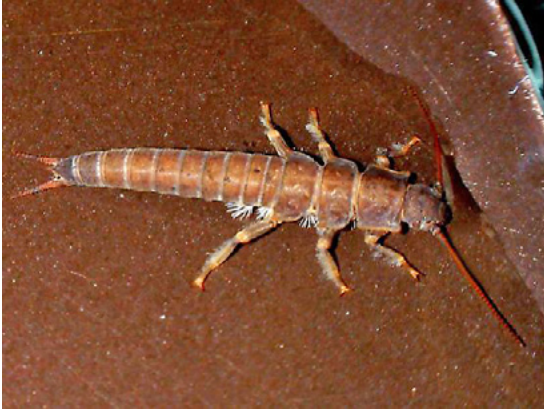
Salmonfly Stonefly larva (Pteronarcyidae)