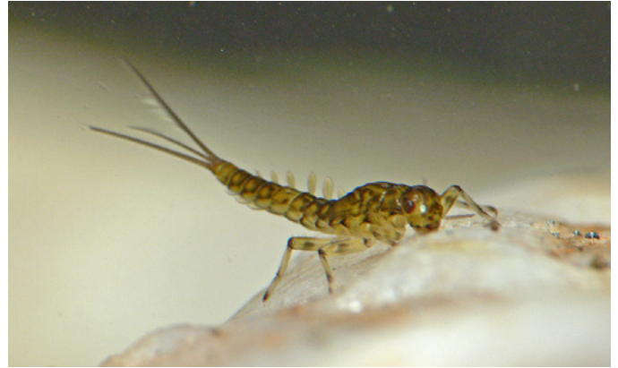
Small Minnow Mayfly larva (Baetidae)