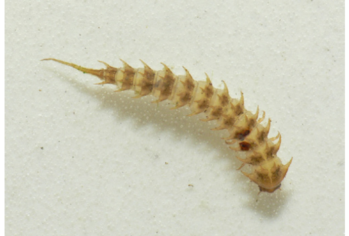
Crawling Water Beetle larva (Haliplidae)