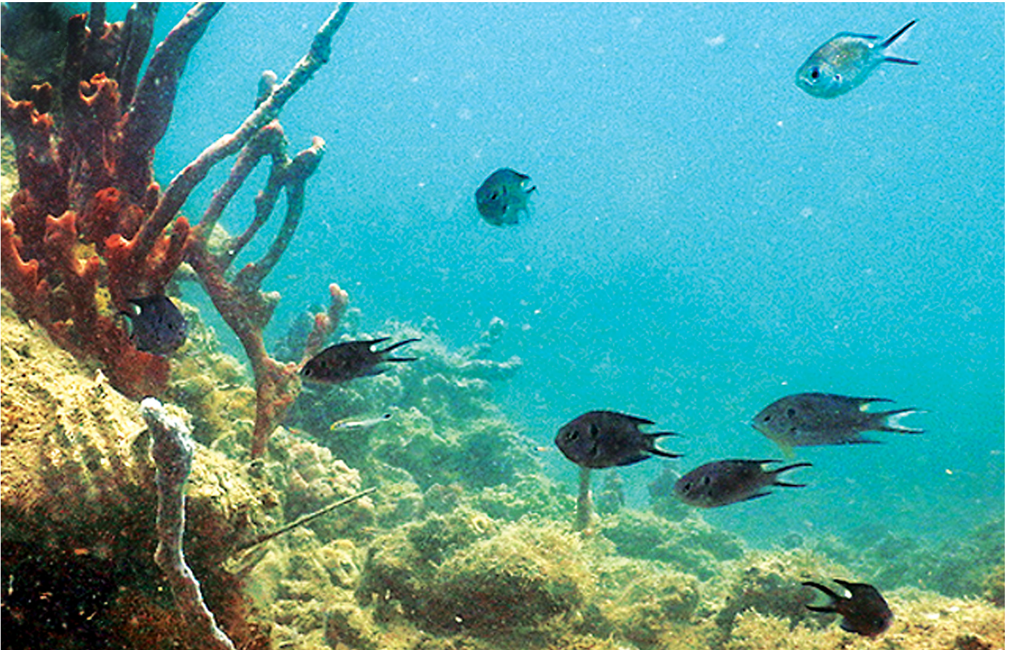
Figure 3. Neopomacentrus cyanomos , seven individuals and a Chromis multilineata (upper right) on a turbid reef adjacent to Veracruz City, July 2015.

consisted of a total volume of 20 \mu\text{L} with 2 \mu\text{L} of 50–100 ng DNA template, 4 \mu\text{L} of 5X buffer, 0.4 \mu\text{L} of 5 U/ \mu\text{L} GoTaq® polymerase (Promega), 1 \mu\text{L} of 10 mM dNTPs, 2 \mu\text{L} of 25 mM \text{MgCl}_2 , and 0.6 \mu\text{L} of 10 \mu\text{M} of each oligonucleotide. The thermal cycler profile consisted of an initial denaturation step at 95°C for 5 min, followed by 35 cycles of 95°C for 30 s, 54°C for 30 s and 72°C for 45 s with a final extension at 72°C for 5 min. The resulting amplicons were purified with the QIAquick PCR purification kit (Qiagen, Inc.), sequenced in both directions using the BigDye Terminator v.3.1 Cycle Sequencing Kit (Applied Biosystems), and read in a 310 Genetic Analyzer (Applied Biosystems) at the Instituto de Ecología, A.C. sequencing facility. Forward and reverse sequences were assembled in Sequencher 5.3 (Gene Codes Corporation) and were manually aligned in Se-Al 2.0a11. Sequences have been deposited in GenBank (accession numbers: KU052527 and KU052528). The obtained sequences were compared to those available in the GenBank database using the program BLAST 2.2.32 (Zhang et al. 2000), which calculates the percent similarity and statistical significance of the match between a query sequence and existing sequences in GenBank.