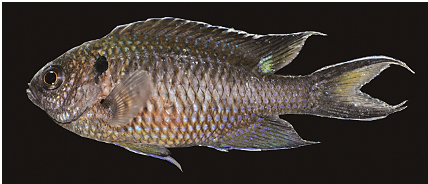
Figure 2. Neopomacentrus cyanomos , fresh specimen immediately after being collected from Madagascar Reef, image reversed.

Total genomic DNA was extracted using a salt-extraction protocol (Aljanabi & Martínez 1997). Primers Fish-F1 and Fish-R1 (Ward et al. 2010, Vinoth et al. 2012) were used to amplify a fragment of the cytochrome oxidase-1 (COI) gene. PCR reactions were carried out in a C1000 Touch™ Thermal Cycler (Bio-Rad) and