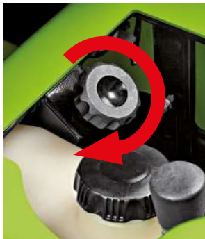
Details of the adjustment

Blades automatically disengage when the grass catcher is full. There is also the possibility to choose the "buzzer" option that signals that the catcher is full, without stopping the blades.