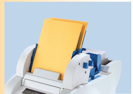
2 sheet feeders and 1 insert/BRE feeder