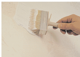
... the KÖSTER AMS 2 Liquid Film is applied. After 1 hour curing time...