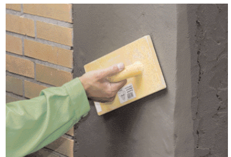
Mix, apply and smooth – done quickly with KÖSTER Betomor® Multi A