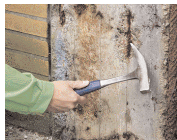
Clearly visible: Concrete maintenance is due here

Whether from moisture or carbonation – in both cases, the steel inside the concrete is attacked. It reacts with carbon dioxide and water to rust. This process, which is accelerated by poor concrete quality and cover, leads to a doub-