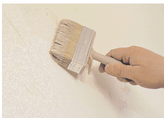
...the KÖSTER AMS 1 Primer and at least 15 minutes later ...