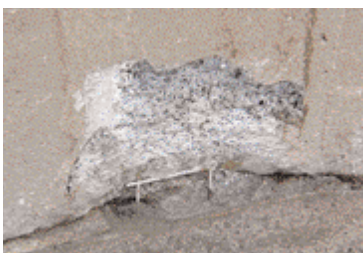
Before repair: On the wall and in the fillet the damage is clearly visible.