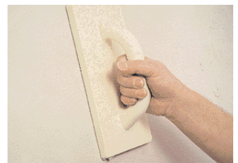
... and – once it has just started to set – leveled with a trowel