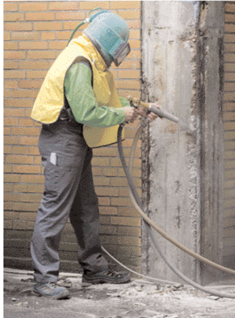
Cleaning the steel reinforcement and concrete by sand-blasting

In order to optimize the required work-steps and to shorten the unavoidable waiting times between them, comprehensive series of tests were carried out in the research and development department of KÖSTER BAU-CHEMIE. Their aim was to offer concrete repair technology that is reliable in design and time-