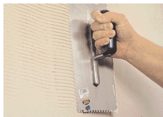
...the KÖSTER AMS 3 Special Plaster is applied uniformly thin...