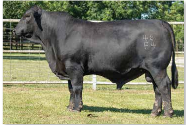
Lot 67 | TANNER BIG TOWN 48F4

He is another deep sided, big butted, Big Town son. He writes 11 EPD traits ranking in the breed's top 35% or greater led by top 4% Fertility Index, 10% Milk, 15% REA, 20% IMF and top 25% WW and YW. His dam was our favorite heifer in the Calyx Star dispersal and she records 1 @ 106 WR.