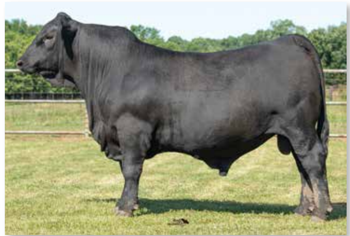
Lot 68 | TANNER STRATEGY 811G2

He is a wide bodied, square hipped, deep sided Strategy son who presents calving ease and more. He writes 9 EPD traits ranking in the breed's top 35% or greater led by top 3% REA, 15% milk, 25% IMF and BW and 35% CED. His dam posts a 352 day calving interval on 3 and big WRs. Take a good look at this prospect.