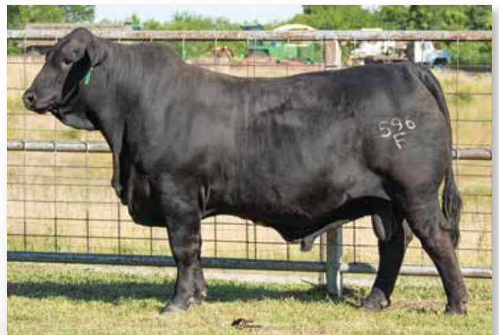
Lot 63 | TANNER BIG TOWN 596F

He is a massively constructed Big Town son. You will appreciate his big rib, length of spine and massive top. His dam is a Patton daughter we have flushed to Big Town, Hollywood, Atlanta and Stonewall and whose great granddam was in the breed's top 5 for REA. He records top 20% REA, 25% Milk, 35% IMF and CED and top 30% Fertility index.