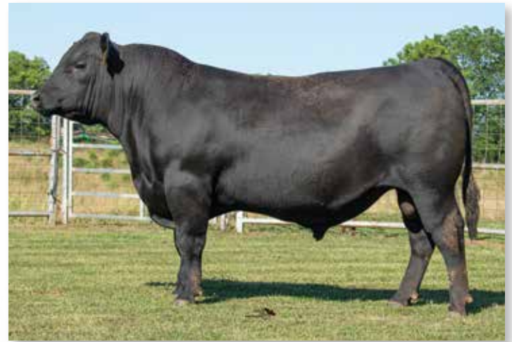
Lot 28 | TANNER DISCOVERY 8954

This wide body records top 10% YW, 15% WR and top 20% milk with top 10% $F, 15% $B and top 30% CW and Marbling. He is sired by the Pathfinder sire, VAR Discovery. His dam, by Final Answer, posts 5 @ 109 WR.