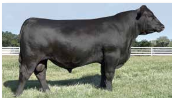
Ref Sire | VAR DISCOVERY 2240