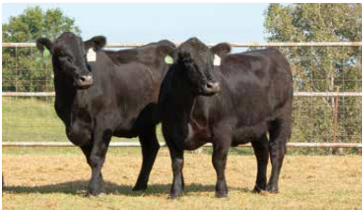
Lot 311 | REGISTERED ANGUS