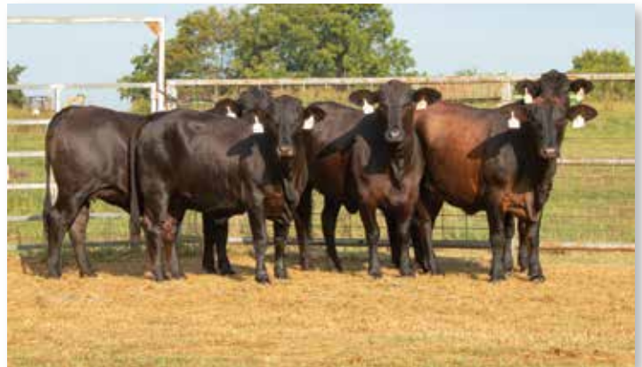
Lot 303 | BRAHMAN x ANGUS F1s