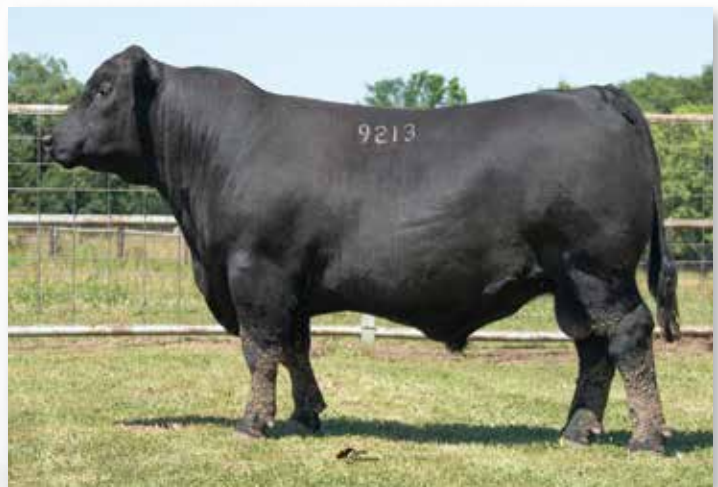
Lot 16 | TANNER REGARD 9213

This massively constructed wide body is deep. He posts top 20% $F and YW with top 30% WW EPDs. His dam features Rito and Gardner breeding.