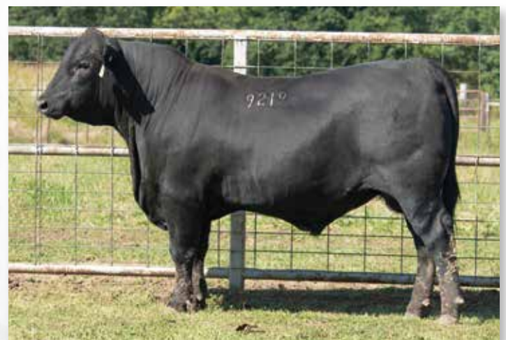
Lot 56 | TANNER ENERGY 9219

This powerful son of Whitestone Energy doe a lot correctly. He writes top 10% WW and YW with top 20% Milk EPDs. He also writes top 3% $F, 5% CW and top 15% $B. His dam records 2 @ 104 WR.