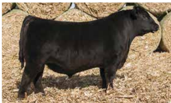
Ref Sire | JINDRA ACCLAIM