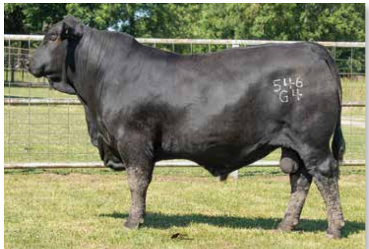
Lot 65 | TANNER BRICKHOUSE 546G4

He is a big ended, big topped, meat wagon sired by Brickhouse. He writes 10 EPD traits ranking in the breed's top 35% or greater led by top 3% REA, 5% WW, 10% YW, 25% IMF and top 30% Milk. His dam posts a 353 day calving interval on 4 and huge WRs.