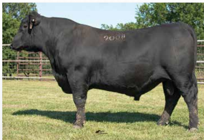
Lot 19 | TANNER 0035 FINALANSWER 9008

This calving ease e prospects is another wide bodied, big middled Tanner Angus bull who is moderate in his kind. He is sired by Final Answer and records top 30% CED, 45% BW, 15% WW and top 25% YW EPDs. His dam is by Whitestone Armando and posts 2 @ 106 WR.