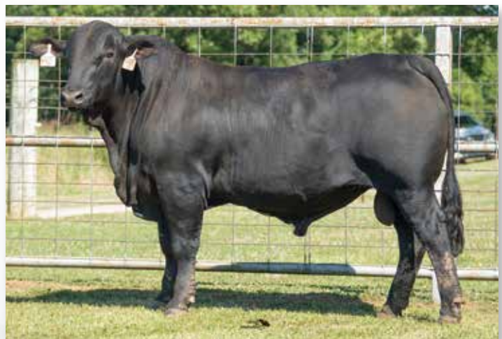
Lot 139 | TANNER HOLLYWOOD 302G

Balancing EPDs, this young bull records top 20% REA, 25% WW and SC and 30% YW and IMF. He is also top 25% HP and 30% Fert and Term indices.