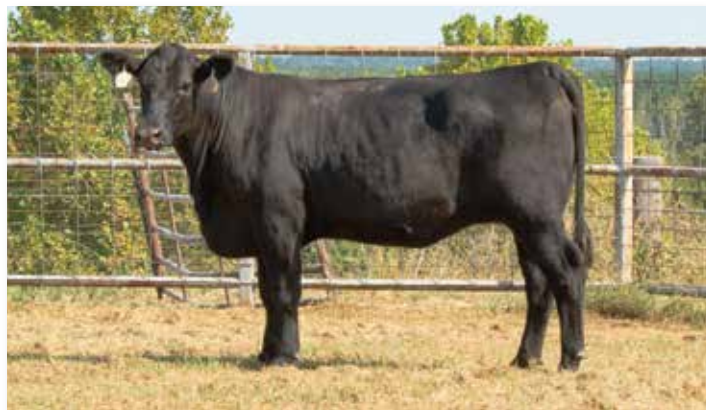
Lot 320 | COMMERCIAL ANGUS

302 BRED HEIFERS 4 HEAD X $ _____ TAGS 211, 212, 213, 214