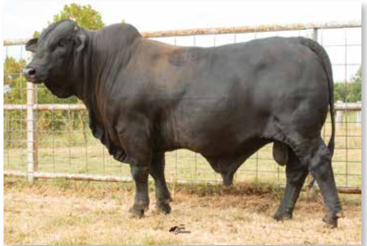
Lot 101 | TANNER 52G3

98 TANNER 01G Half Blood • 01G • 1/3/2019 • Bull SIRE: KEMPFER BRAHMAN BULLS DAM: TANNER ANGUS COW Act BW: 88 Adj WW: 747