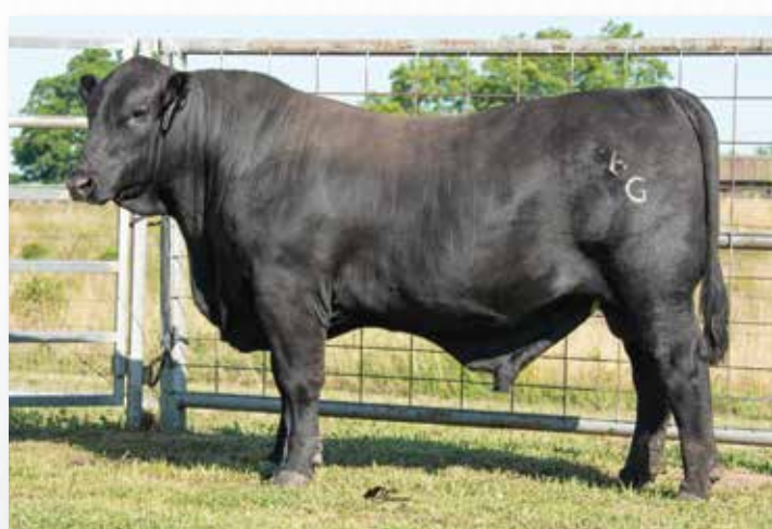
Lot 135 | TANNER ULTRABLACK 69G

If you are breeding heifers you need to look at this lot. He is in the top 15% for BW EPD as well as 25% IMF, 30% REA and Milk and ranks in the top 10% for his Fert Index.