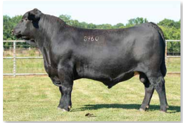
Lot 27 | TANNER ACCLAIM 8960

This powerful son of Jindra Acclaim does it all. He is thick made, long sided and deep ribbed. He records EPDs ranking in the breed's top 10% milk and YW, 20% WW and top 1% $B, $F and CW. His donor dam posts 4 @ 101 WR and 3 @ 103 YR.