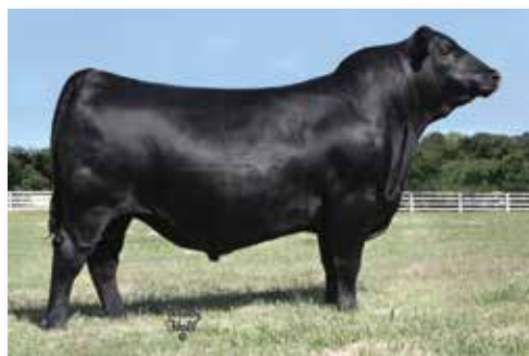
Ref Sire | VAR RANGER 3008