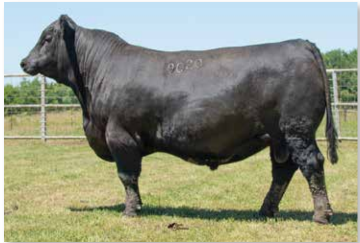
Lot 15 | TANNER 6128 PROPHET 9020

He is a calving ease son of son of GAR Prophet and his dam is a Resource daughter with a 360 day calving interval on 2. He is long sided, deep bodied and well made. He posts top 20% CED, 40% BW and top 25% WW, YW and Marbling.