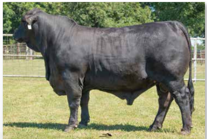
Lot 69 | TANNER STONEWALL 795G

He is a wide bodied Stonewall grandson. He records top 1% of the breed REA EPDs along with top 20% Fertility Index and top 35% YW and CED EPDs.