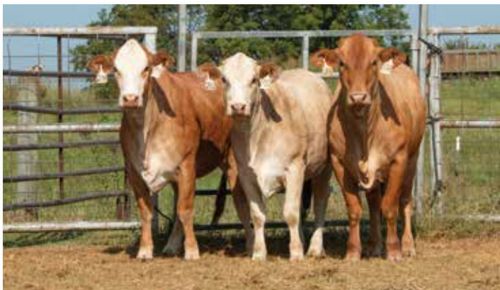
Lot 315 | BRAHMAN x HEREFORD F1s