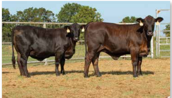
Lot 308 | REGISTERED BRANGUS