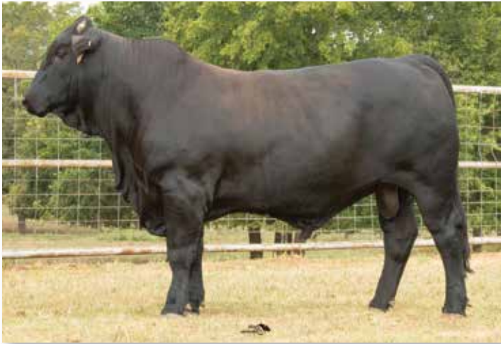
Lot 100 | TANNER 35G

This set of Half Blood bulls are sired by easy fleshing high performing Kempfer bulls and out of our proven Tanner cow herd. We have 5 to choose from and they come with all the hybrid vigor and quality true F1's bring to the table at no extra charge.