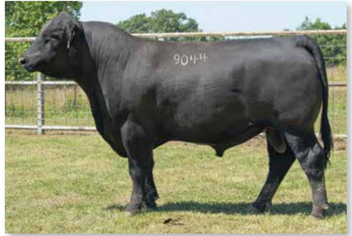
Lot 61 | TANNER 502 LONG HAUL 9044

He is sired by the Pathfinder sire Mohnen Long Haul and projects top 20% Milk, 30% Marbling and top 35% BW EPDs.