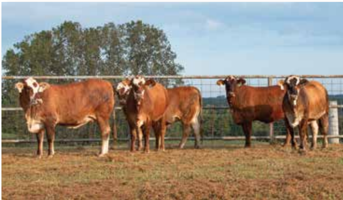
Lot 300 | BRAHMAN x HEREFORD F1s