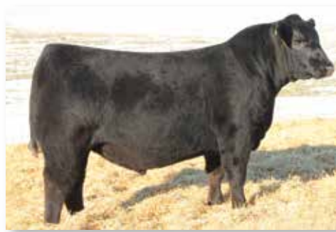
Ref Sire | SAV RECORD HARVEST 2186