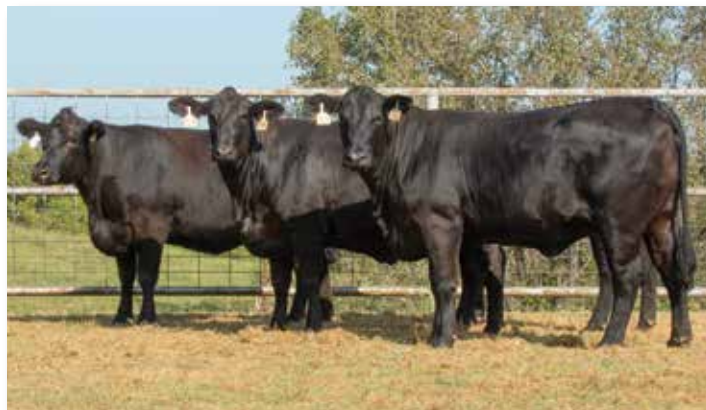
Lot 313 | COMMERCIAL ANGUS