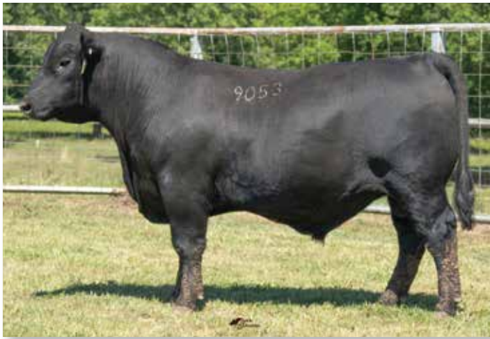
Lot 50 | TANNER 3022 TEN SPEED 9053