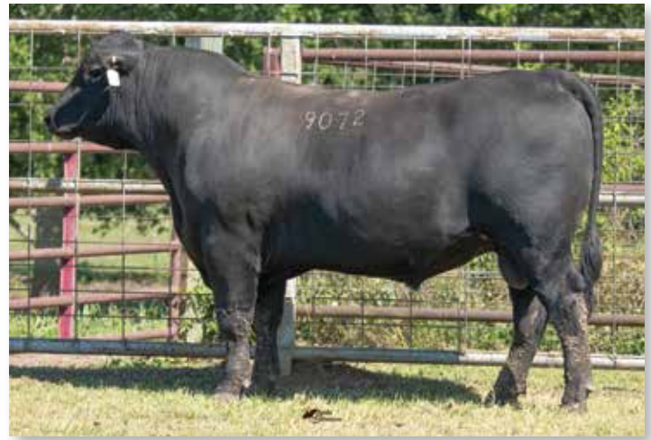
Lot 24 | TANNER 0010 PLATINUM 9072

He is a powerful son of SAV Platinum who writes EPDs ranking in the breed's top 10% YW and top 15% WW, CW and $F. His dam is a Record Harvest daughter and posts a 353 day calving interval on 2 and 2 @ 106 WR and YR.