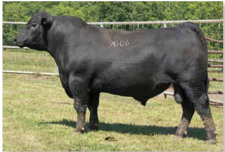
Lot 21 | TANNER 316 CAPITALIST 9006

He is another power bull and is sired by LD Capitalist. He posts top 5% YW, 10% WW and CW with top 2% $F and 20% $B EPDs. His dam, by SAV Recharge, posts a 370 day calving interval on 2 and a WR of 103 and YR of 106.