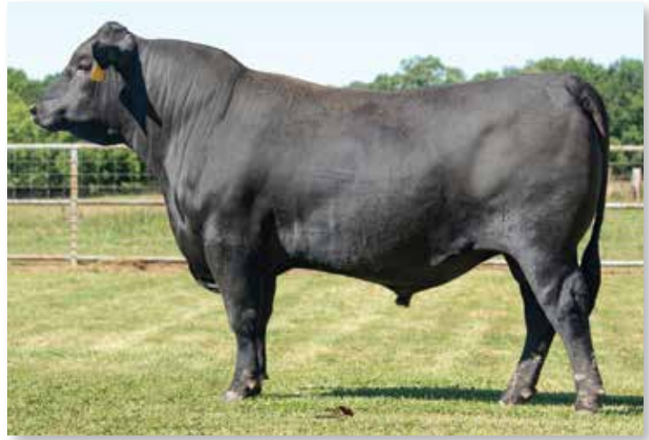
Lot 30 | TANNER BLACKHAWK 8966

He is a long bodied calving ease specialist with power. Phenotypically pleasing, he ranks in the breed's top 30% CED, 15% YW and top 20% WW and Milk. He also writes top 10% $F, 25% $B and top 30% CW. His dam posts a WR of 103 on her calves.