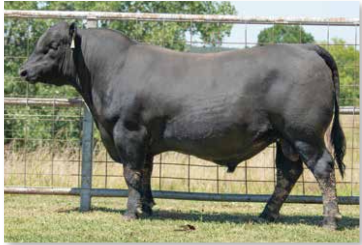
Lot 14 | TANNER 2240 DISCOVERY 9023

Out of a first calf heifer he ratioed 107 WR and 111 YR. Sired by the Pathfinder sire, VAR Discovery, he records 14 EPD traits ranking in the breed's top 35% led by top 10% YW, 15% WW and 20% Milk while posting top 5% $B and top 10% $F and CW.