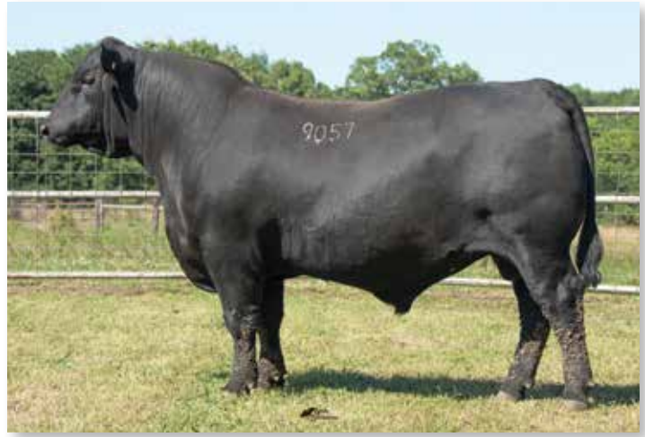
Lot 20 | TANNER STONEWALL 9057

This stout son of Whitestone Stonewall is a power bull ranking in the breed's top 10% WW and YW, 4% $F, 5% $B and top 15% CW and Marbling. He would be perfect in a retained ownership situation.