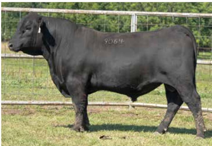
Lot 52 | TANNER 3008 RANGER 9064

This calving ease specialist does a lot of things right. He writes top 20% CED and Milk, 25% BW and top 30% YW EPDs. His dam posts a 376 day calving interval on 2.