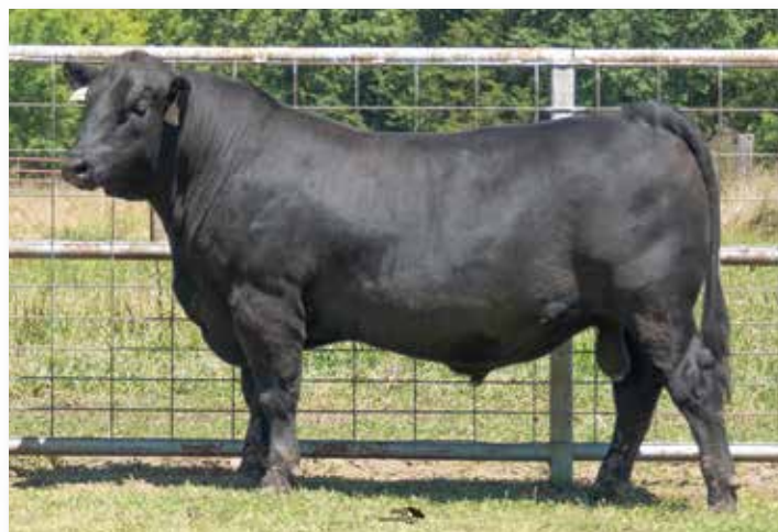
Lot 18 | TANNER BLUESTEM 9236

This Bluestem son projects top 25% YW and top 30% WW and Milk with top 10% $F, 15% RE, 20% CW and top 25% $B. His dam posts 2 @ 102 WR and 114 RE.