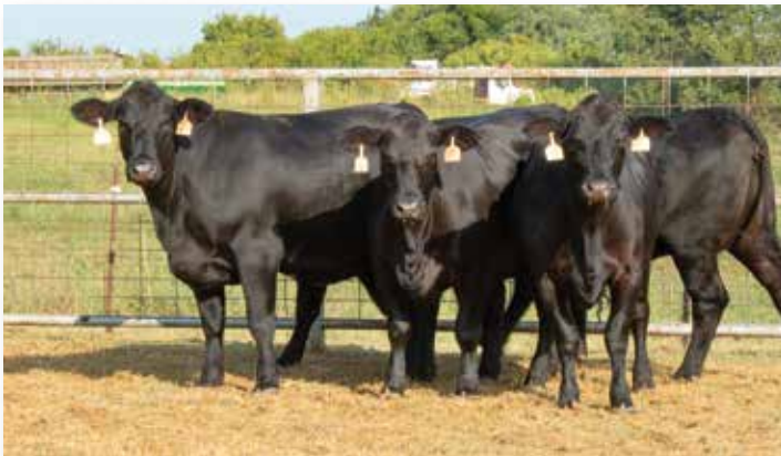
Lot 304 | REGISTERED ULTRABLACK