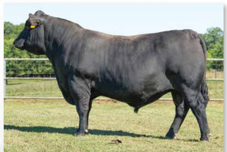
Lot 29 | TANNER UPWARD 9114

This big bodied thick topped bull is sired by Tanner Upward 107Z. He writes EPDs ranking in the breed's top 35% CED, 10% YW, 20% WW and top 15% Milk while ranking in the top 1% $F, 2% $B, 3% CW and top 15% RE. He is out of a first calf Ten X daughter who weaned him with a 106 WR.