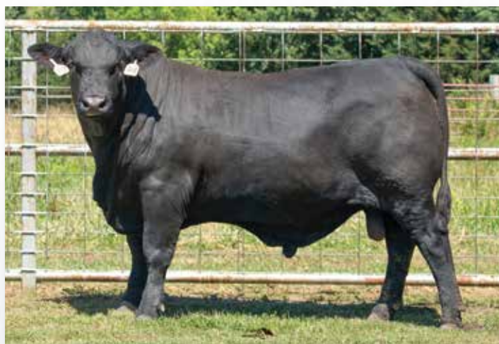
Lot 74 | TANNER ULTRABLACK 81G

He is an easy fleshing, wide bodied Ultrablack from our program. He does a lot right. He writes 10 EPD traits ranking in the breed's top 35% including top 15% Fertility Index, WW, YW and REA with top 25% IMF and Milk.