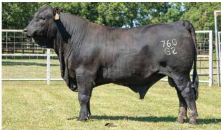
Lot 129 | TANNER ULTRABLACK 760G2

Sired by Tanner Tour of Duty 5927, he records top 30% WW and 35% WW EPDs.