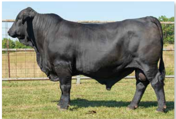
Lot 64 | TANNER ATLANTA 596F9

He is a big boned, big middled and loose made maternal brother to the previous lot. He is sired by the Superstar of Balance, Atlanta. He posts EPDs ranking in the breed's top 20% REA, 25% IMF and top 35% Fertility index with below breed average birth and CED and above average growth.