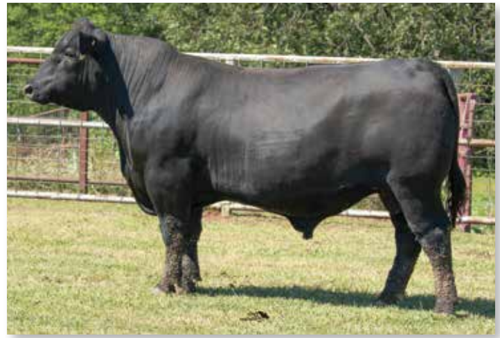
Lot 23 | TANNER TEN SPEED 9081

He is a son of Tanner Ten Speed. He records EPDs ranking in the breed's top 35% for WW and top 40% for YW and CW. His Pathfinder dam, Whitestone Rita A073, posts 5 @ 110 WR and 107 YR.