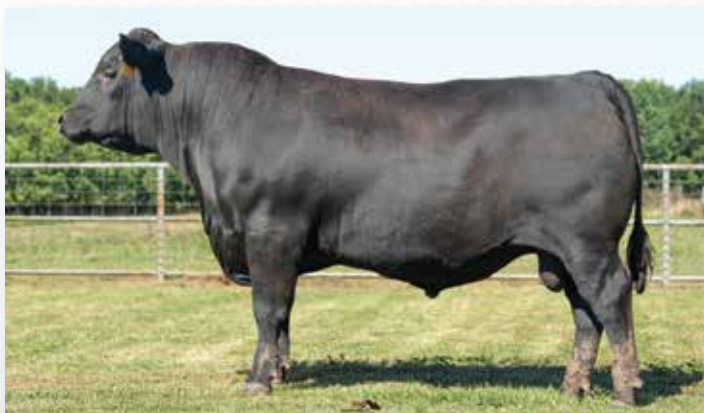
Lot 108 | TANNER FOREMAN 8962