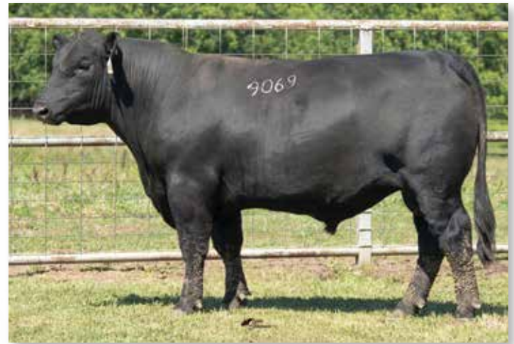
Lot 55 | TANNER RENOWN 9069

This son of SAV Renown writes EPDs ranking in the breed's top 20% WW and top 25% YW and RE. His dam records 3 @ 106 WR.