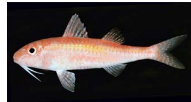
Fig. 5. Holotype of Parupeneus minys , BPBM 35553, 70 mm SL, Poivre Atoll, Amirantes, Seychelles, 43–48 m.

Paratypes. BPBM 40948, female, 83.5 mm, USNM 395007, female 79.5 mm, both with same data as holotype; BPBM 27693, female, 83 mm, India, Kerala, Vizhinjam fishing harbour (south of Trivandrum), purchased from fisherman, J. E. Randall, 13 February 1980; MNHN 2008-2473, male, 106 mm, same data as preceding; SAIAB 81381, male, 106.5 mm, Mozambique, 20°14.8'S, 35°48.4'E – 20°16.3'S, 35°48.4'E, R/V Dr. Fridtjof Nansen Station 76, trawl, 54–55 m, P.C. & E Heemstra, 12 October 2007.