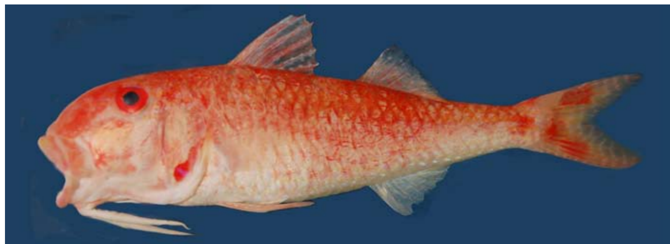
Fig. 8. Paratype of Parupeneus nansen , USNM 395047, male, 139 mm SL, Mozambique, 26°9.5'S, 32°58.5'E, 43–45 m.

Scales finely ctenoid; scales dorsally on head extending forward to an orbit diameter from front of upper lip; six oblique rows of large scales on cheek to edge of preopercle; the first two rows embedded, extending above curved posterior part of maxilla, the last row of two scales at corner of preopercle; opercle largely covered by seven partially fused scales of variable size; subopercle and interopercle covered by a row of six scales, progressively shorter anteriorly; two scales on expanded posterior side of maxilla, the anterior about one-third size of posterior and overlapping base of posterior scale; fins naked except for base of caudal fin with three rows of scales like those of body, followed by columns of small slender scales extending about half way out in fin; slender pelvic axillary scale nearly one-half length of pelvic spine; a midventral scaly process of two rounded scales at base of pelvic fins, the anterior broadly overlapping the posterior; sensory canals on