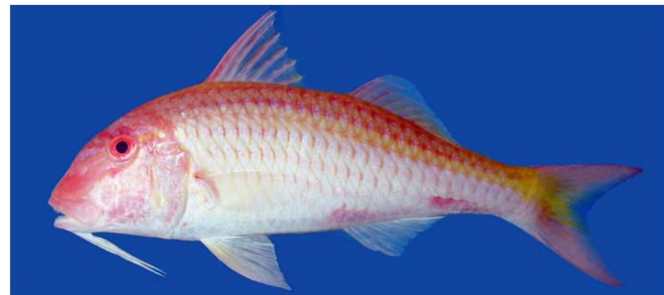
Fig. 9. Parupeneus seychellensis , SAIAB 77868, 170 mm SL, Mahé, Seychelles, 17 m.

The pectoral-ray counts of 15 or 16 (mainly 16) and the gill-raker counts of 6 or 7 + 21–23 of Parupeneus nansen are the same as those of P. heptacanthus . The two species are readily distinguished in life colouration (compare Figs. 2 and 3 of P. heptacanthus with Figs. 7 and 8 of P. nansen ). The most important morphometric differences are the longer barbels of P. heptacanthus , 1.0–1.3 in HL in 15 Bishop Museum specimens, 60–257 mm SL, compared to 1.3–1.45 in HL of P. nansen , and the pelvic fins are longer in P. heptacanthus , 1.3–1.5 in HL, compared to 1.5–1.65 in P. nansen .