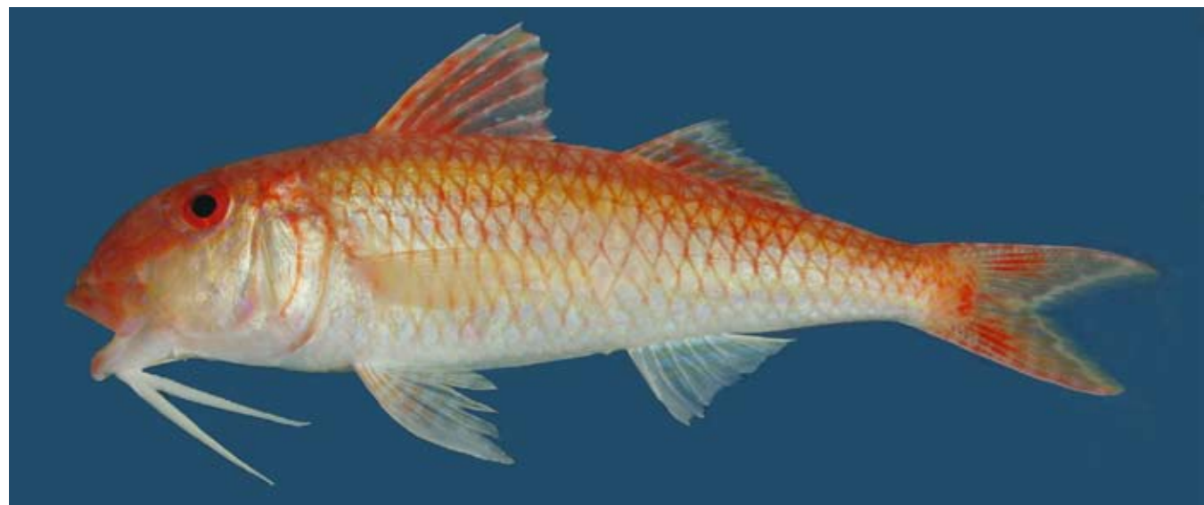
Fig. 7. Holotype of Parupeneus nansen , SAIAB 81380, 125 mm SL, Mozambique, 24°33'S, 35°15'E, 50–51 m.