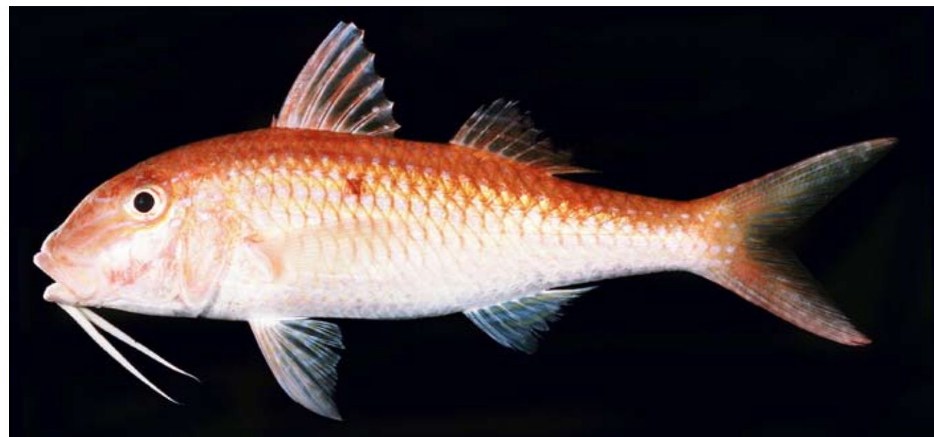
Fig. 1. Parupeneus heptacanthus , BPBM 29732, 130 mm SL, Lombok, Indonesia.