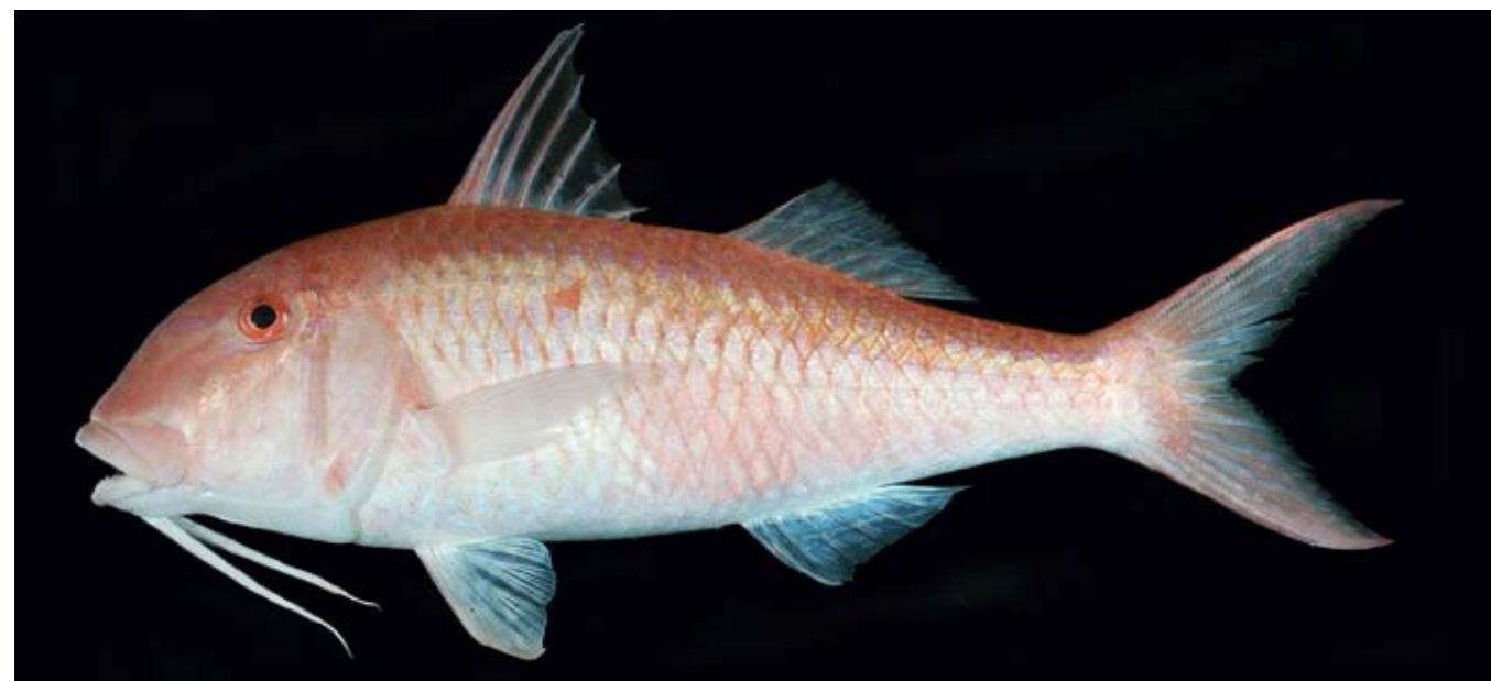
Fig. 2. Parupeneus heptacanthus , HUJ 8330, 225 mm SL, Gulf of Aqaba, Red Sea.