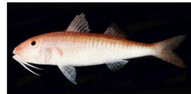
Fig. 6. Paratype of Parupeneus minys , BPBM 27693, 83.5 mm SL, Kerala, India.

DIAGNOSIS. Pectoral-fin rays 15 or 16; gill rakers 6 + 21–22; body elongate, the depth 3.95–4.3 in SL; head length 2.9–3.05 in SL; interorbital space flat medially; snout length 2.05–2.3 in HL; posterior edge of maxilla symmetrically convex; maximum depth of maxilla 5.45–5.8 in HL; barbel length 1.35–1.45 in HL; longest dorsal spine 1.8–1.95 in HL; pectoral fins 1.3–1.4 in HL; pelvic fins 1.5–1.65 in HL; colour in alcohol uniform tan except for specimens from the Seychelles with areas of white ventrally on head below eye and on lower two-fifths of body; no dark markings; fins translucent pale yellowish; colour when fresh, pink dorsally, pale pink to white ventrally, with an indistinct pale yellow stripe along lateral line; some lateral-line scales with a bluish white dash; a bluish white line encircling ventral part of eye and continuing obliquely to upper lip; three small bluish white blotches dorsally on head, one directly above eye; barbels white; median and pelvic fins translucent blotchy yellow with small pale blue to whitish spots along rays that outline faint transverse yellowish bands. Largest specimen, 106.2 mm SL.