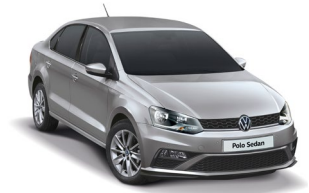
Reflex Silver Metallic