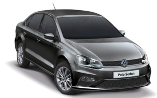
Deep Black Pearlescent