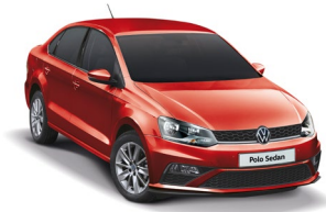
Flash Red Non-Metallic

The illustrations on this page can only be regarded as a general guide as the printing process cannot render the true depth and brilliance of the paint finishes with absolute accuracy. Please note that certain paint and trim combinations may not be available.