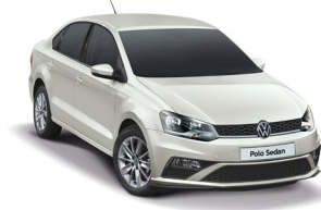
Candy White Non-Metallic