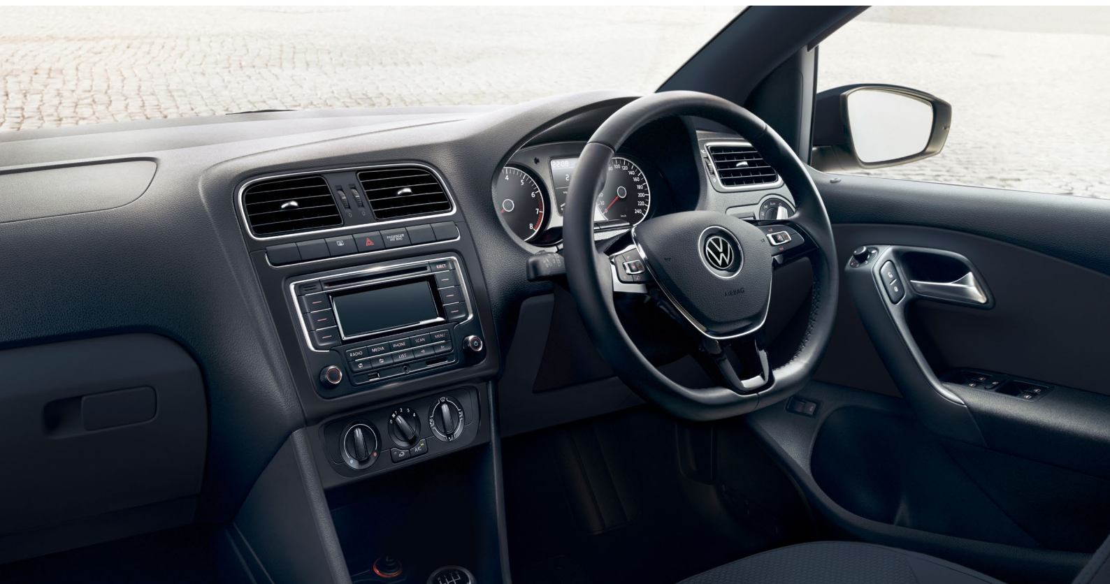
Image does not depict the new RCD-R340G radio (standard on Comfortline)

The standard Climatic® airconditioner ensures a pleasant temperature throughout your Polo Sedan, whatever the weather outside. The RCD-R340G radio, standard on the Comfortline, features Bluetooth and USB functionality, App-Connect and a colour touchscreen, as well as four premium speakers that deliver superior sound quality.