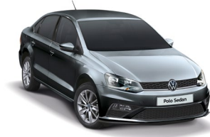
Carbon Steel Grey Metallic