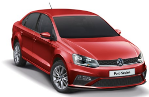
Sunset Red Metallic