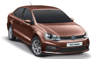
Toffee Brown Metallic