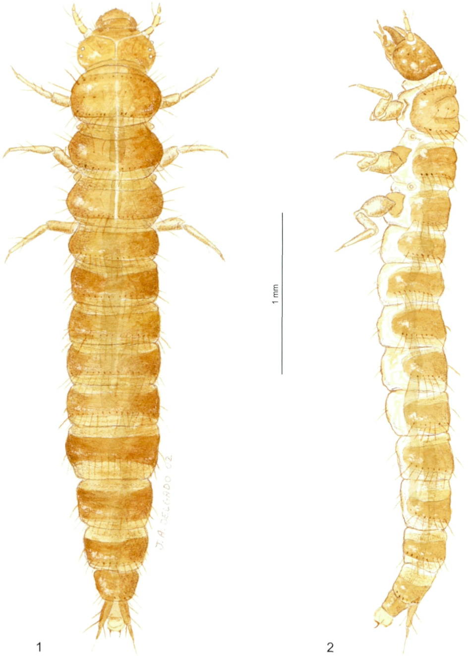
Figs. 1 - 2: Third instar larva of Ochthebius (s.str.) gonggashanensis , habitus: 1) dorsal view, 2) lateral view.