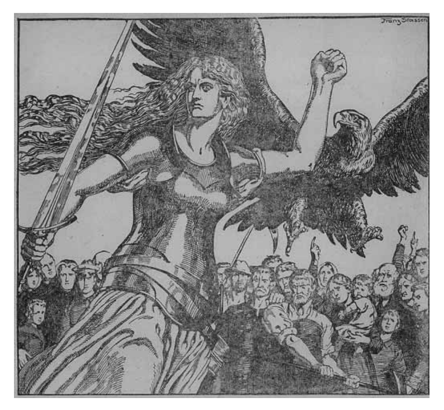
6. Graphics from the leaflet "To the German People ( An das Deutsche Volk )," published by the government in December 1916

The images of the August enthusiasm published at the beginning of the war depict a moment of great festivity. (In 1914 the visual imagery of the August enthusiasm was developed independently of the government; it was the result of the effort of publishers, especially those who printed postcards, to make money out of the Great Times.<sup>52</sup> The government, charging that such advertising methods were beneath it, did not become involved in visual propaganda until 1916.) There are happy soldiers parading, happy soldiers on trains leaving (see illustration 5). Seldom is there any depiction of grim determination, except in an allegorical form, in the imagery of the furor teutonicus . Yet, as with the popular plays