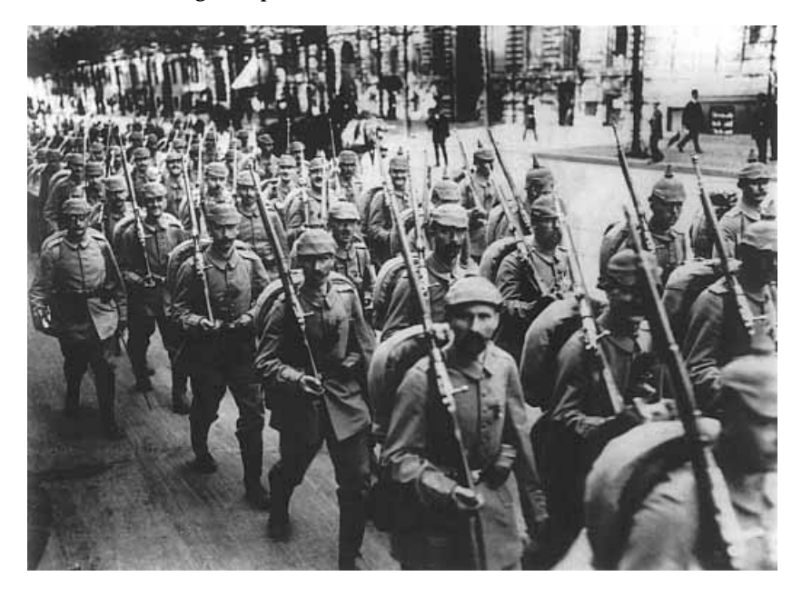
2. Troops marching through Düsseldorf in August 1914 on their way to the front

Toward the end of the month the curious people turned their attention to the wounded. Around 15 August the first trains with wounded pulled into Berlin. As one Tägliche Rundschau journalist noted, "that pulls. One wants to see that. Chocolate and books are packed, roses are bought, bottles of wine put in paper bags."<sup>36</sup> Crowds of thousands showed up at the train stations. A Münchener Zeitung journalist found all this undignified, complaining that the audience was looking down upon the injured "as if it were all simply a pleasant theater piece."<sup>37</sup> Eventually the government took measures to shield the wounded from the curious, to keep the public out of the train stations where there were wounded.