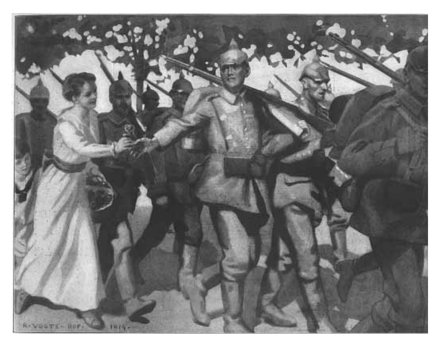
3. Drawing of troops marching to the front by R. Vogts for the Berliner illustrierte Zeitung , 6 September 1914, p. 651

Kaiserslautern, Zweibrücken, Worms, Homburg, Düsseldorf, Cologne, Strasburg, and elsewhere crowds of curious women greeted the first trains filled with prisoners of war just as they had the departing soldiers, giving flowers and Liebesgaben to the vanquished warriors. In Stuttgart some women even called up the government to ask where they could find prisoners to bring flowers.<sup>38</sup> This positive attitude towards prisoners of war took place only in western Germany, and largely toward French