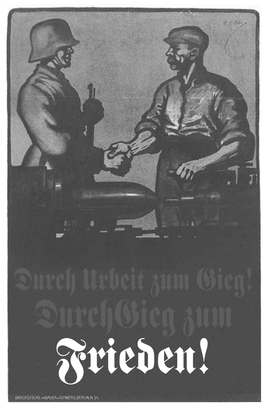
7. "Through Hard Work to Victory. Through Victory to Peace." Poster by A. M. Cay, published by the government in 1918