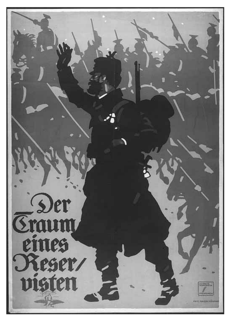
9. "The Day-Dreams of a Reservist." Poster by Ludwig Hohlwein for a film with this title from late 1914