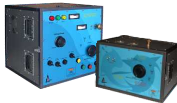
Optional: Surge Generators and AE101