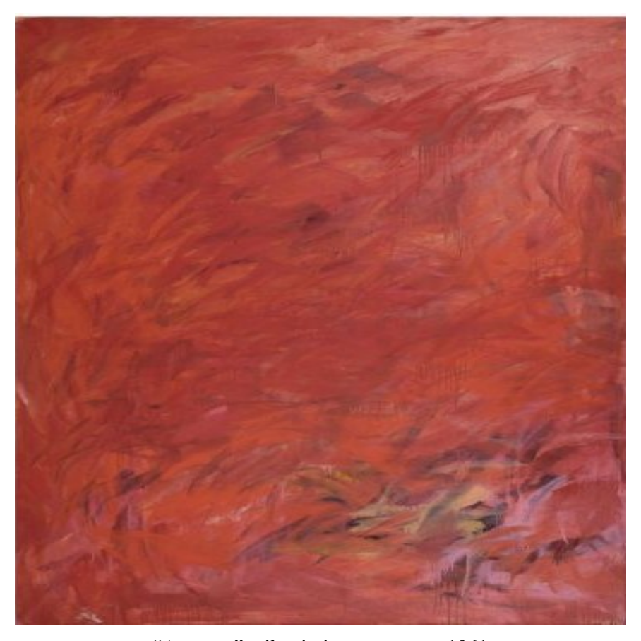
"Anonym", oil painting on canvas, 1961