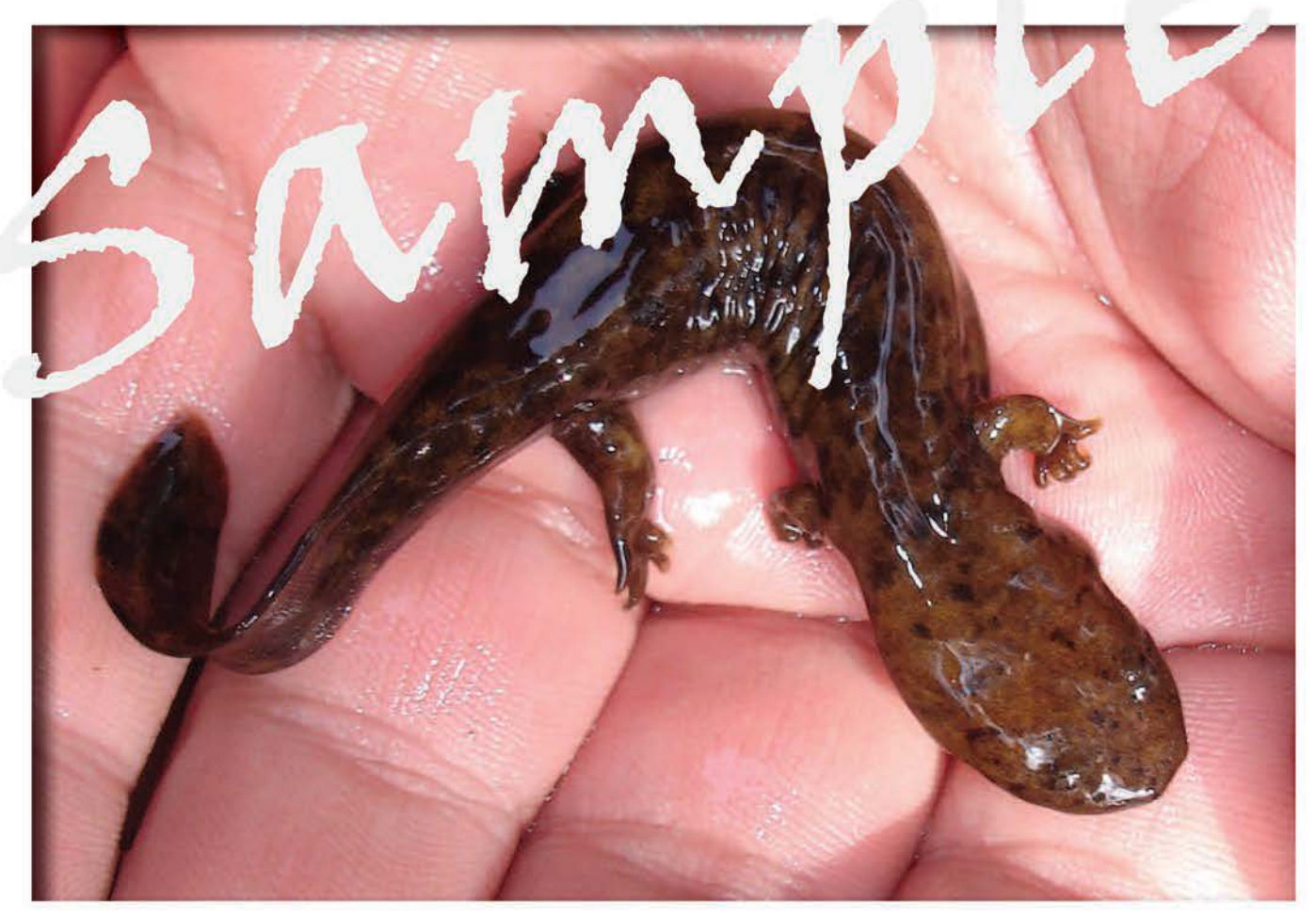
Figure 3. Juvenile hellbenders begin to resemble adults once they reach 2 years of age.

Quick Facts Hellbenders are indicators of good ecosystem health, and are found in streams with high-quality water.