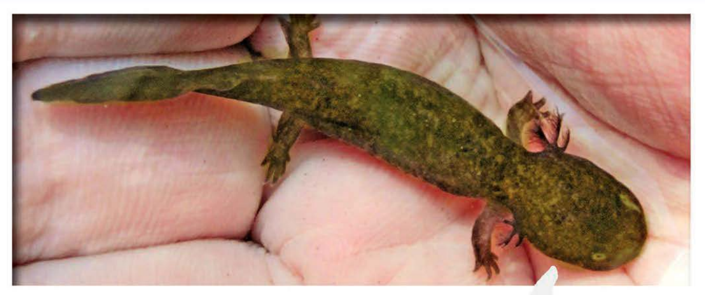
Figure 2. Larval hellbenders have large plume-like external gills.