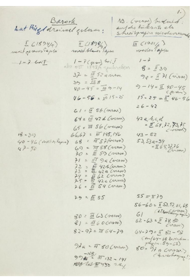
Figure 1 Karl M. Swoboda's scheme of Riegl's lecture notes on Baroque art (first page), ca. 1960.

In the second folder of Riegl's lecture notes, before and separate from the corpus of Die Entstehung , are found five handwritten notes on white paper in a hand that conforms to the one of Swoboda.<sup>25</sup> The first four pages of Swoboda's notes show a scheme of Riegl's lectures notes on Baroque art, organized into three groups (Fig. 1). The illustrated subdivision of the material corresponds to the chronological sequence of Riegl's lecture notes and also provides information on the different uses of paper. Thus, as stated by Witte, it reflects the current sorting of Riegl's manuscripts into the first two folders, which group together the three lectures on Baroque art and presumably goes back to Swoboda.26 The first grouping on Swoboda's scheme, that is, the lecture notes of the first course, 'Art History of the Baroque Age,' corresponds to the first archival folder. The remaining two groupings, with reference to the lecture notes on 'Italian Art History from 1550 to 1800' (1898-99) and the materials for the following third course,