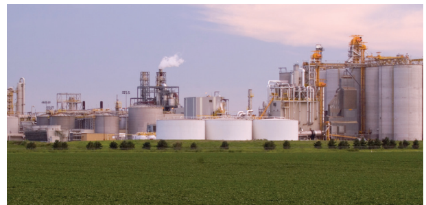
IsoStab® has been proven effective in every type of ethanol operation.

Ethanol production facilities across North America, as well as numerous scientific studies have proven that IsoStab® works as promised. These plants have eliminated the use of chemical antibiotics and produced more valuable co-products. In many cases plants have actually increased ethanol yield by using IsoStab® in combination with VitaHop® Silver fermentation enhancer.