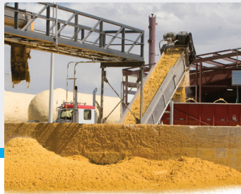
IsoStab® results in higher value, antibiotic free DDGs.