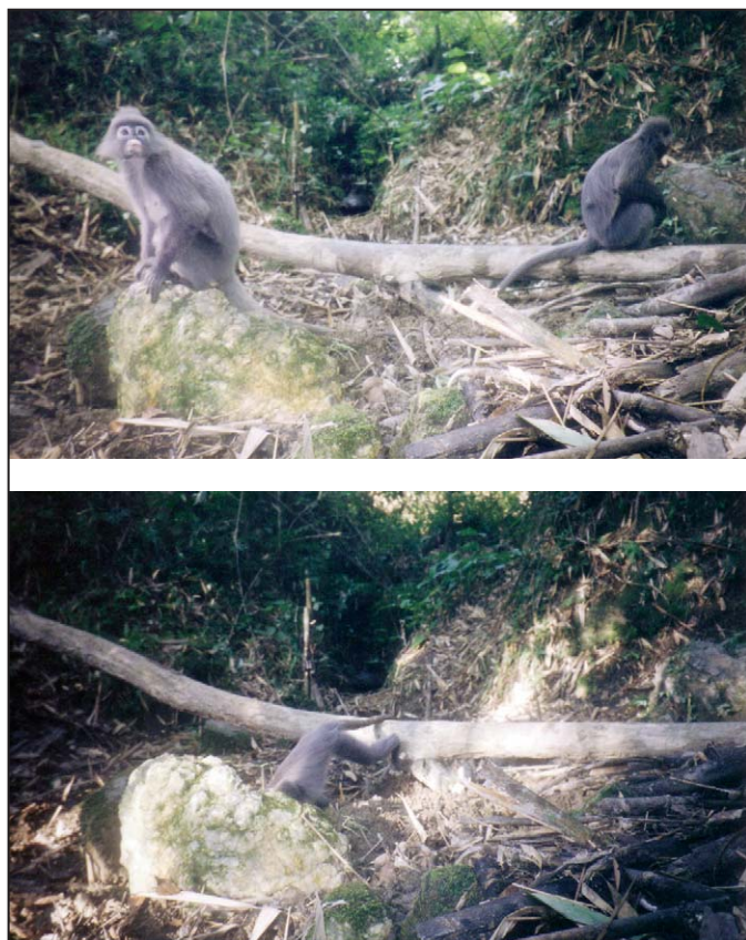
Figure 2. Phayre's leaf monkeys Trachypithecus phayrei at a mineral lick in Nam Et–Phou Louey National Protected Area, Lao PDR, 18 January 2005. (above) two animals resting; (below) one animal eating or drinking.

Objective identification of Lao sightings of gray leaf monkeys as Phayre's leaf monkey needs care, because another gray species, Indochinese silvered leaf monkey T. germaini (also of disputed taxonomy), inhabits the country. There are too few Lao specimens of gray leaf monkeys to define even the coarse ranges of both these species (Table 1; also, Timmins et al. 2011). Although the two are readily separated with good views and careful observation, monkeys recorded