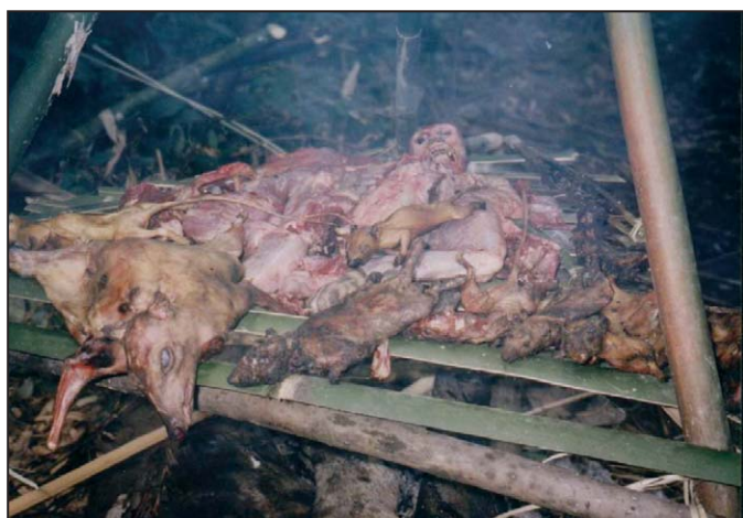
Figure 3. The head of a hunted Phayre's leaf monkey Trachypithecus phayrei , being cooked as part of professional hunters' haul of mixed wildlife. Muang Sanakham, Vientiane province, Lao PDR, 30 October 2000.

Muang Sanakham, Vientiane province. A skin and head (Fig. 3) were seen at a hunters' camp beside the Houay Oum (18°07'20"N, 101°29'50"E; c. 300 m) amid hills supporting extensive tall bamboo and riverine forest (Fig. 4) on 30 October 2000 (Hansel 2004, where the record was dated erroneously as 2004 in Table 1); the skull and a photograph of the skin were sent to the Natural History Museum, London, UK (registration number BMNH 2010.310). Although skulls are difficult to identify objectively to species (Pocock 1935), the overall gray color of the skin, especially of the tail, suggests T. p. crepusculus (D. Brandon-Jones in litt. 2011). A group of six (five adults and one young molting from orange to gray pelage) was seen in tall bamboo and secondary growth with remnant tall trees from semi-evergreen forest at Kok Kawdinpang (18°18'05"N, 101°46'49"E, taken from a GPS under WGS84 datum; c. 500 m), east of Ban Phonsavat, in Phou Gnouey Production Forest Area (= PFA) on 6 April 2010 (Suford in press ). Villagers reported near-daily