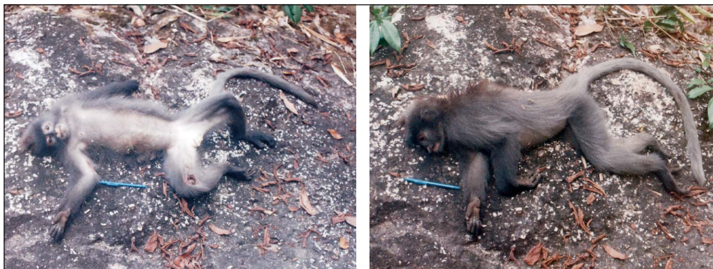
Figure 5. Recently shot Phayre's leaf monkey Trachypithecus phayrei , Lower Nam Ngiap catchment, Lao PDR, 17 February 1999.

No Lao Phayre's leaf monkey record with habitat information comes from deep within extensive closed-canopy forest. Instead, records are from forests with broken canopy and extensive tall bamboo, such features perhaps resulting from human land-use ancient or recent, underlain by geological