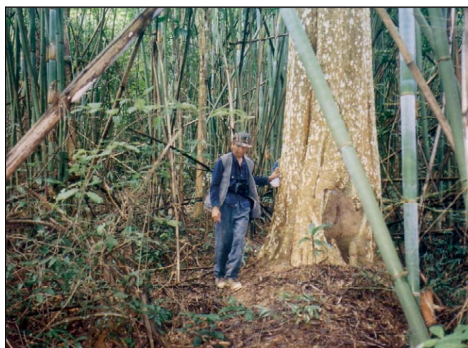
Figure 4. Typical tall bamboo habitat of Phayre's leaf monkey Trachypithecus phayrei , Muang Sanakham, Vientiane province, Lao PDR, October 2000.