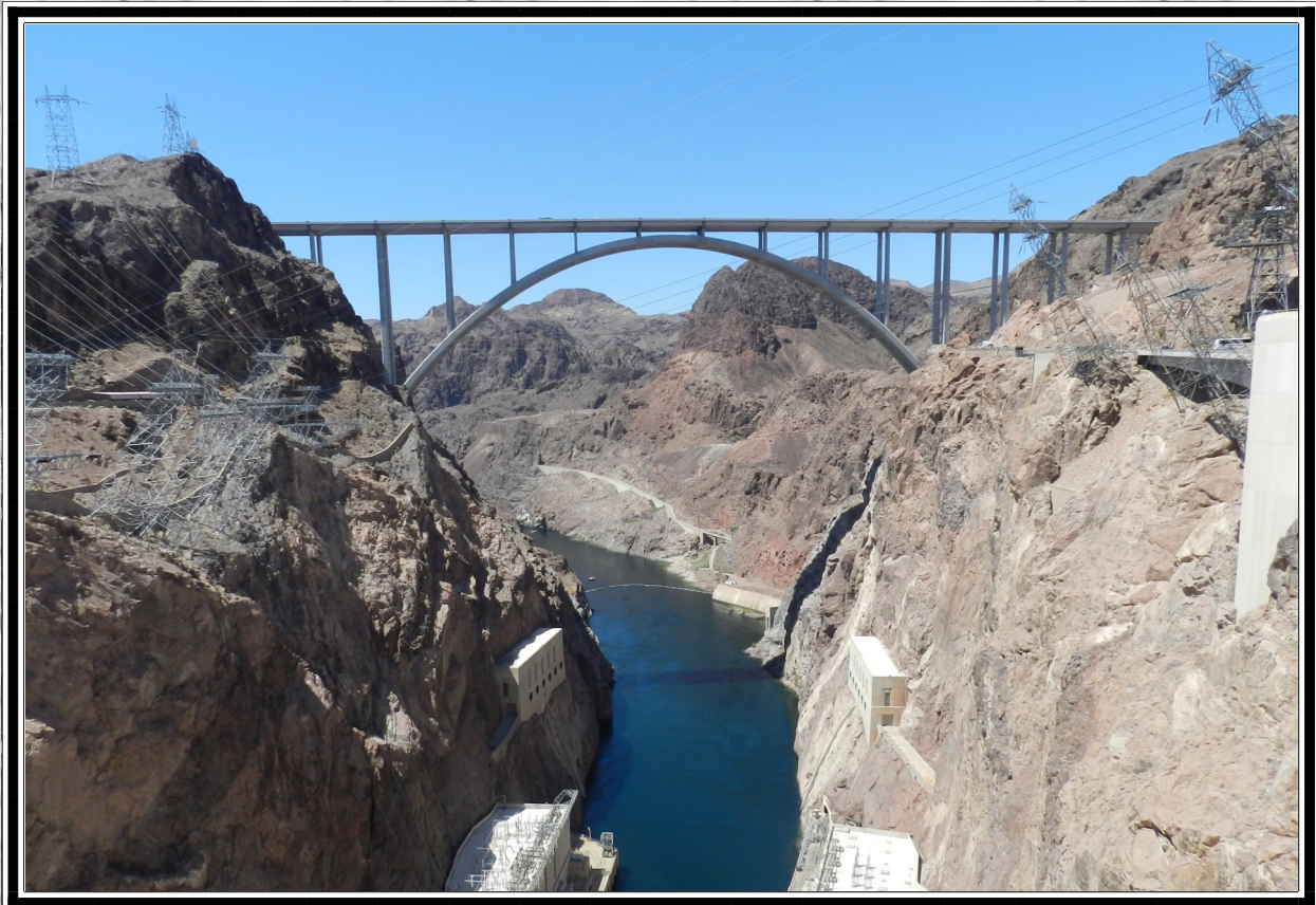
View of Mike O'Callaghan-Pat Tillman Memorial Bridge