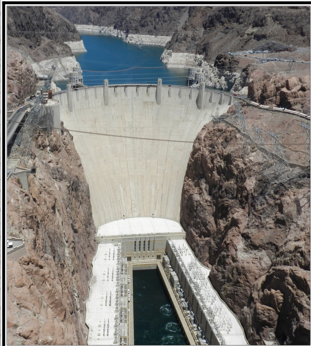
Spectacular view of Hoover Dam from the Mike O'Callaghan- Pat Tillman Memorial Bridge