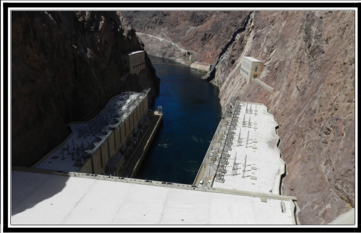
View of power plants from top of the dam.