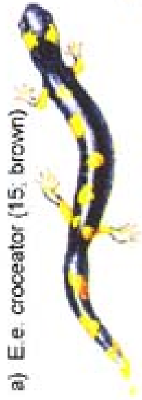
a) E. e. croceator (15; brown)