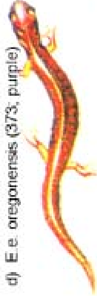
d) E. e. oregonensis (373; purple)