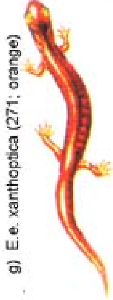
g) E. e. xanthoptica (271; orange)