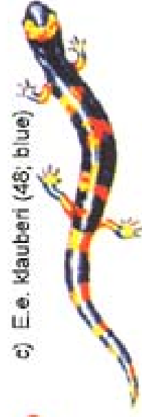
c) E. e. klauberi (48; blue)