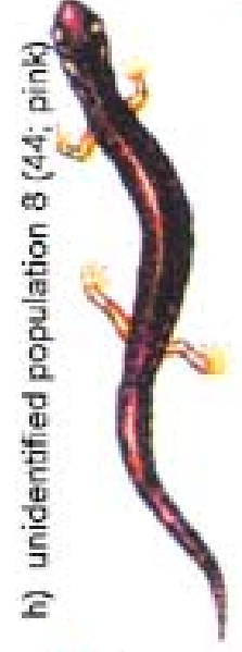
h) unidentified population 8 (44; pink)