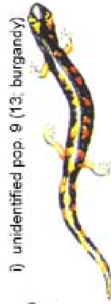
i) unidentified pop. 9 (13; burgandy)