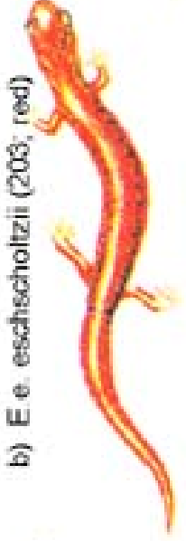
b) E. e. eschscholtzii (203; red)