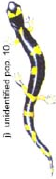
j) unidentified pop. 10