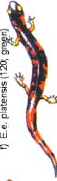
f) E. e. platensis (120; green)