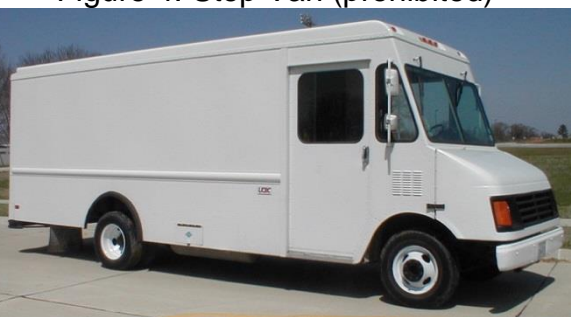
Figure 4: Step Van (prohibited)