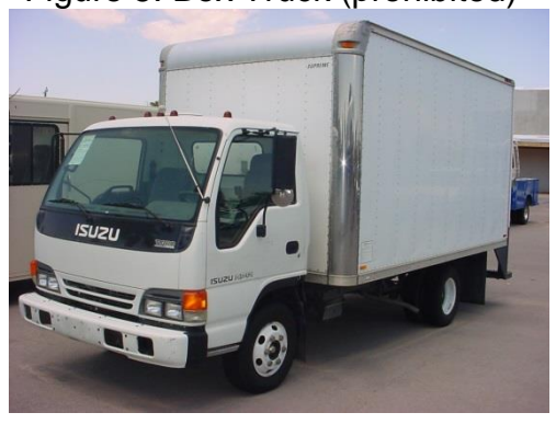
Figure 5: Box Truck (prohibited)