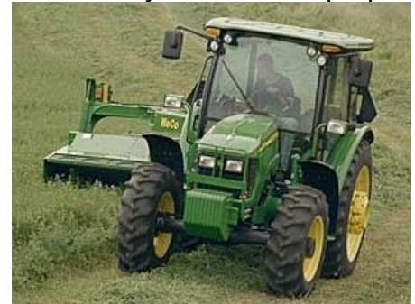
Figure 11: Agricultural vehicle (allowed if only used on the property)