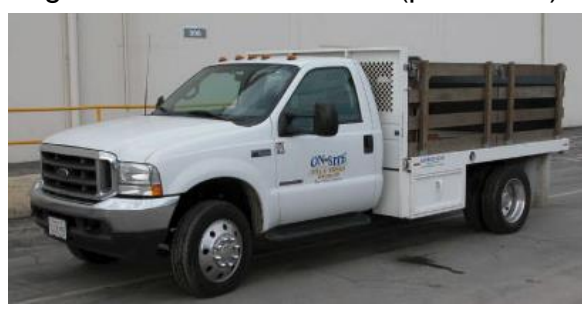
Figure 3: Stake Bed Truck (prohibited)