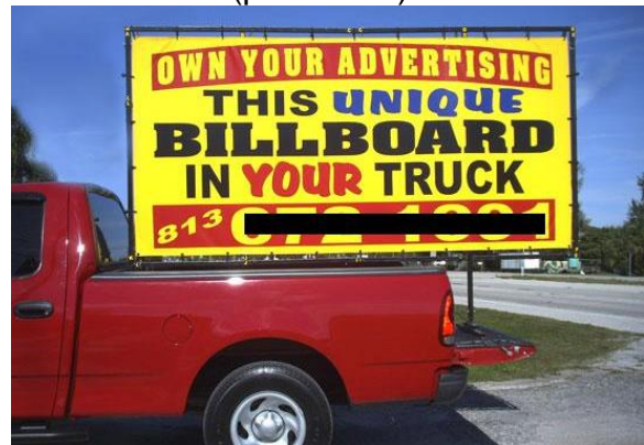
Figure 8: Modified for Advertising (prohibited)