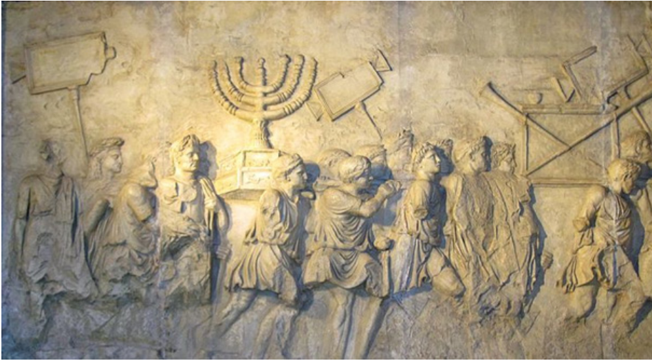
Fig 6. Detail, Arch of Titus: Spoils of the temple of Solomon.