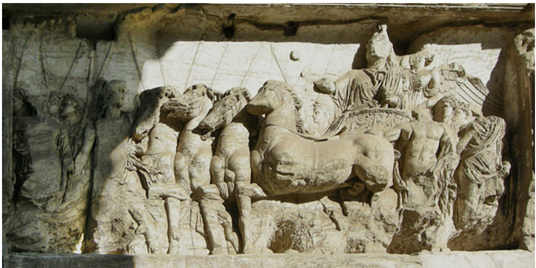
Fig 5. Detail, Arch of Titus: Titus as triumphator in quadriga .

On the southern frieze of the inner arch the spoils of King Soloman from the sack of the Great Temple at Jerusalem are depicted being paraded through Rome on their way to be deposited in Vespasian’s Temple of Peace (Fig. 6). These scenes preserve the memory of the triumphal procession, recalling the day itself. Details of the procession including informative placards including images and names of the conquered cities and peoples are visible in the background and may depict those actually marched through Rome on the day of triumph. The frieze includes a figure that has been interpreted as the River Jordan. Personifications of the Roman people (a partially nude figure) and the Senate (a toga-clad figure) are also evident. In the central arch, Titus is carried heavenwards by Jupiter’s eagle (Fig. 7). This representation of the emperor’s apotheosis reinforced the divine ancestry of the current emperor, Domitian.