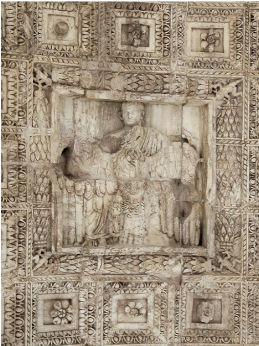
Fig. 7 Detail, Titus' Arch: Apotheosis of Titus.

The depth of the relief sculpture on this monument is notable. Those figures in the foreground stand out dramatically against the shallow carvings of background figures. Originally constructed using Pentelic marble the monument was restored using travertine after being used as part of a medieval wall that saw conflict in the twelfth and thirteenth centuries. 16 Some external reliefs were removed during the medieval period and reused in other buildings and holes in those reliefs still attached to the arch are the product of its incorporation into the medieval Frangipani fortress. 17 The arch features engaged columns with fluted shafts and an early use of composite capitals. The spandrels are home to winged victories holding wreaths, who rest their feet on globes, and the keystones display representations of virtus and honor . 18