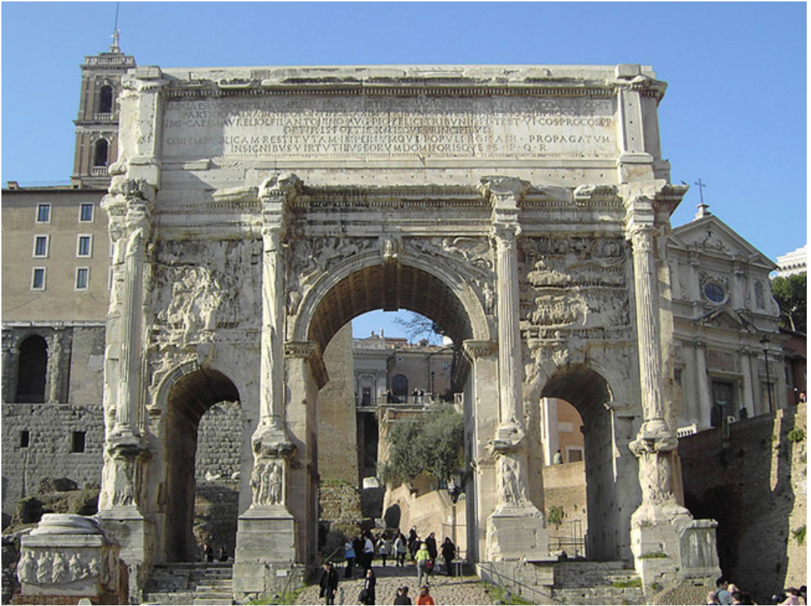
Fig. 9 Arch of Septimius Severus, Rome.

the victorious emperor addressing his troops and the attack on Ctesiphon, the Parthian capital city, with war machines.