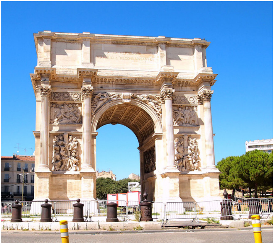
Fig. 8 Arch of Trajan, Benevento.

building. The reliefs, therefore, are civic rather than militarily focused. Trajan's benevolence is depicted in a scene where he gives financial support to the poor children of Benevento ( alimenta ). Also featured in this panel are the people of Benevento and a female personification of the city. An imperial procession is depicted on another panel, part of which is an illustration of Trajan passing under an arch. Numerous divinities are depicted on the arch including the Capitoline Triad (Jupiter, Juno and Minerva), as well as Hercules, Bacchus, Ceres and Mercury.