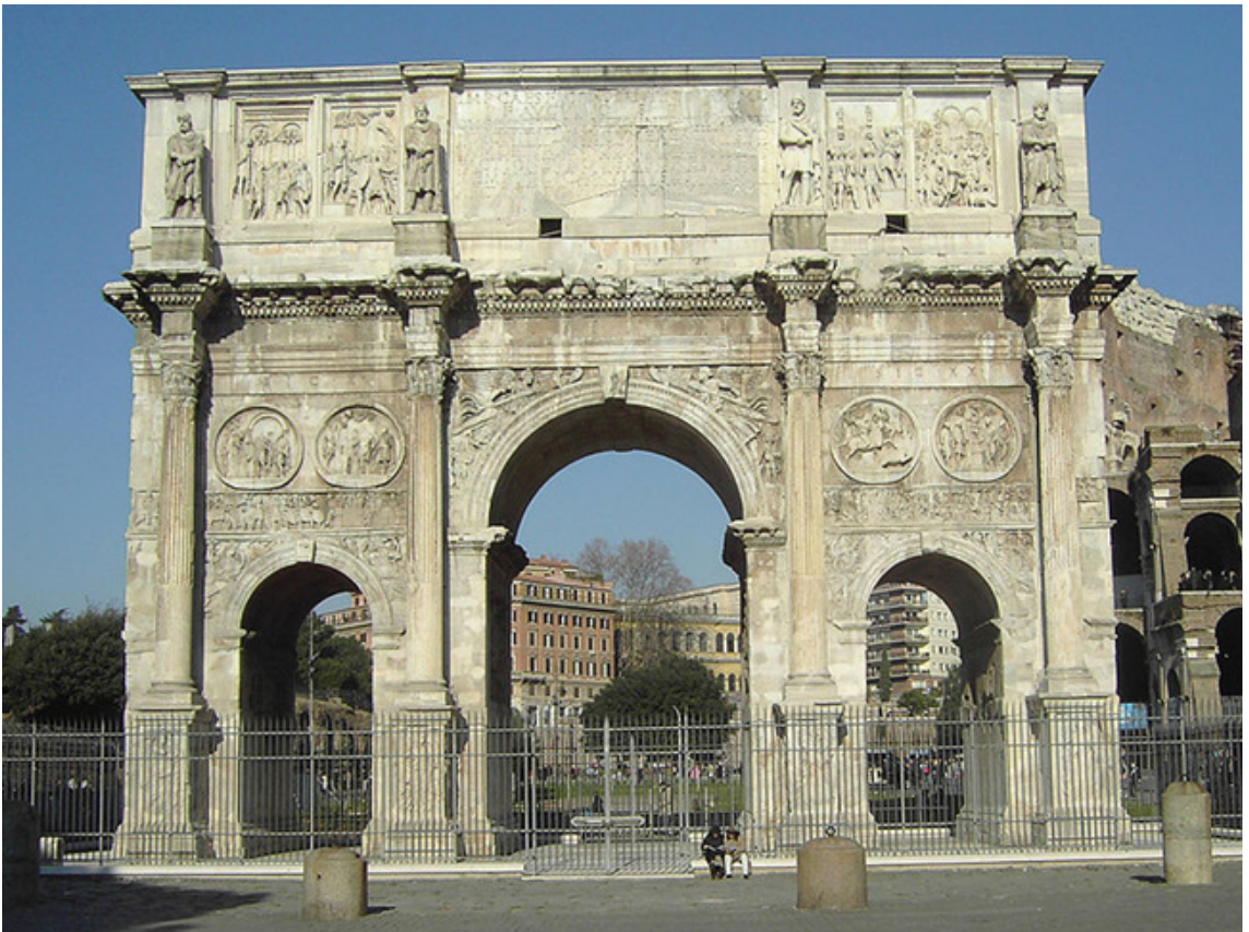
Fig. 10 Arch of Constantine, Rome.

To the Emperor Flavius Constantine, the Great, pious and fortunate, the Senate and People of Rome, because by divine inspiration and his own great spirit with his army on both the tyrant and all his faction at once in rightful battle he avenged the State, dedicated this arch as a mark of triumph.