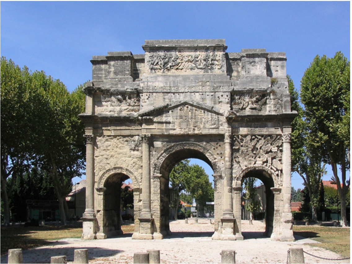
Fig. 3 Arch of Tiberius, Orange.

over what the inscription originally said as well as the date of the arch's construction. 12 It is thought that the arch was erected in c. 25 BCE to commemorate Roman victory over the Gauls and serve as the town's northern gateway. The arch was reconstructed in the 1820s after being incorporated into the medieval city walls. Its east end is better preserved than the west, and the north face is the best-preserved surface.