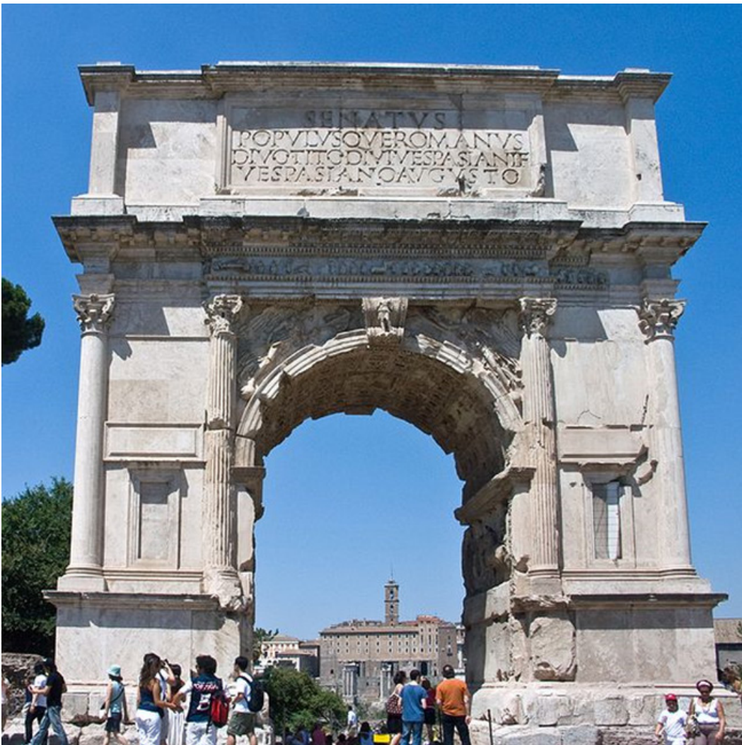
Fig. 4 Arch of Titus, Rome.

The most striking difference between this and earlier triumphal arches is that it is not in Rome and it is therefore not associated with either a triumphal route or a triumphal procession. The arch is located on the Via Agrippa , along a trade route between Lyon and Arles, on the border of Gaul and Provincia Romana . It marks a boundary between civilization and barbarism and is an early symbol of Rome's imperial power over the land and sea.