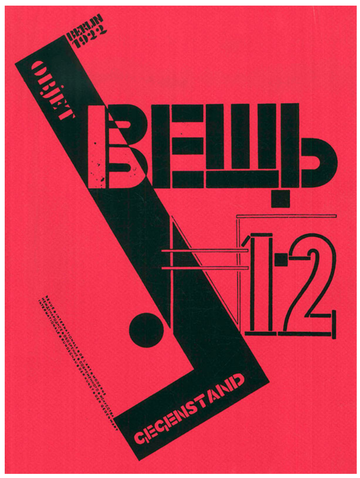
Cover of the journal Veshch/Gegenstand/Objet (1922), edited by El Lissitzky and Ilya Ehreburg.