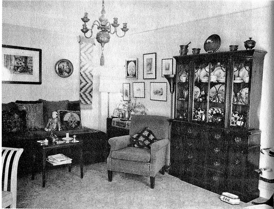
FIGURE 3. Ambros Adelwarth's living room. 333

Both of these domestic spaces appear in a book that thematizes emigration and exile and whose characters are never shown in an environment that resembles a home in the intimate Bachelardian sense. Instead of a place for imagining, these domestic spaces seem to be, at best, spaces for memory and, at worst spaces that stymie thought and feeling. In that context, it is not surprising that these homes are cold and lack in personality. However, when we consider the homes inhabited by Austerlitz, it is striking to see the same coldness present in two of the most important domestic spaces in the text – the house in Bala, where he lived with his adoptive family, and his own house in London.