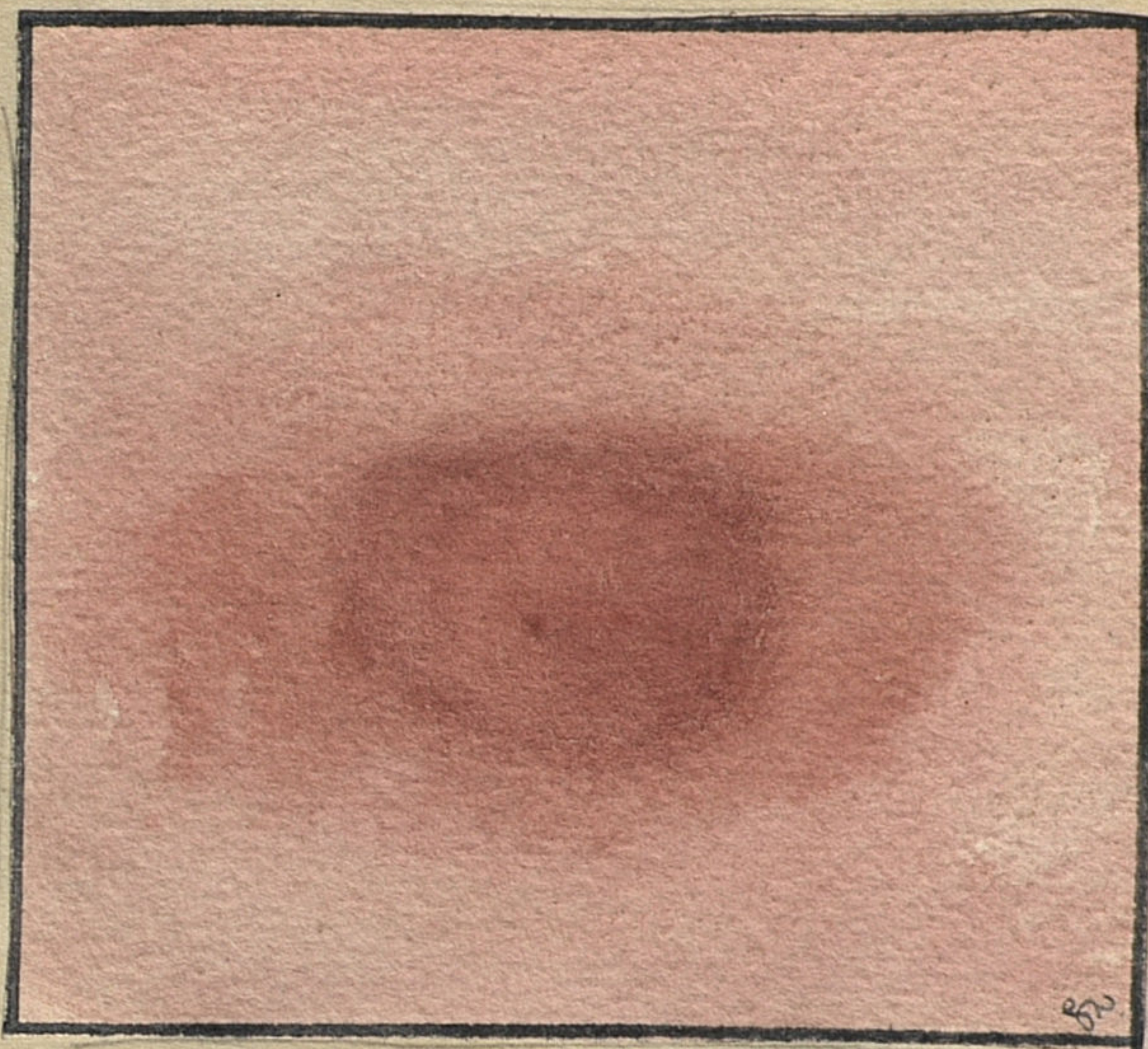
A Pseudo Reaction.