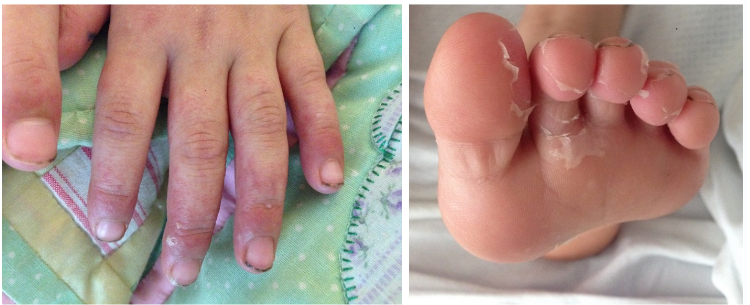
Figure 1. Monomorphic erythematous papules and vesicles on the back (a) and hand (b). Exfoliation is beginning to occur on the distal fingers (b) and toes (c).