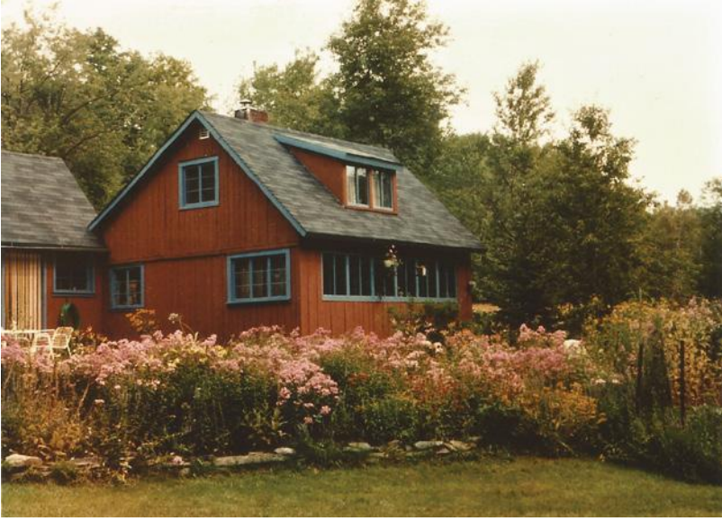
10 The Vermont home.