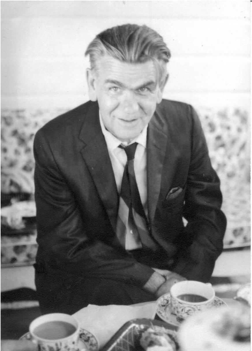
1 Paul Mattick in 1973.