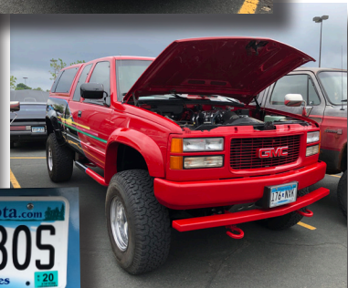
GMCs at the "Back to the '80s" car and truck show in Burnsville, MN. Quite a few Pontiacs also, and (3) DeLoreans!