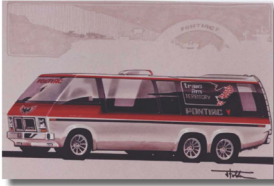
The GMC TA Traveler

The Newsletter of the GMC Truck Chapter of POCI