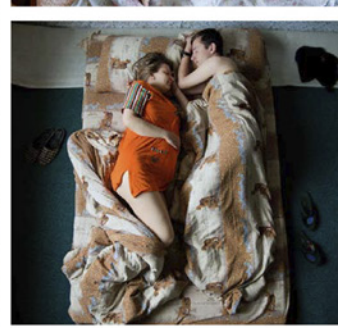
47 DAYS JAPAN 2014/10