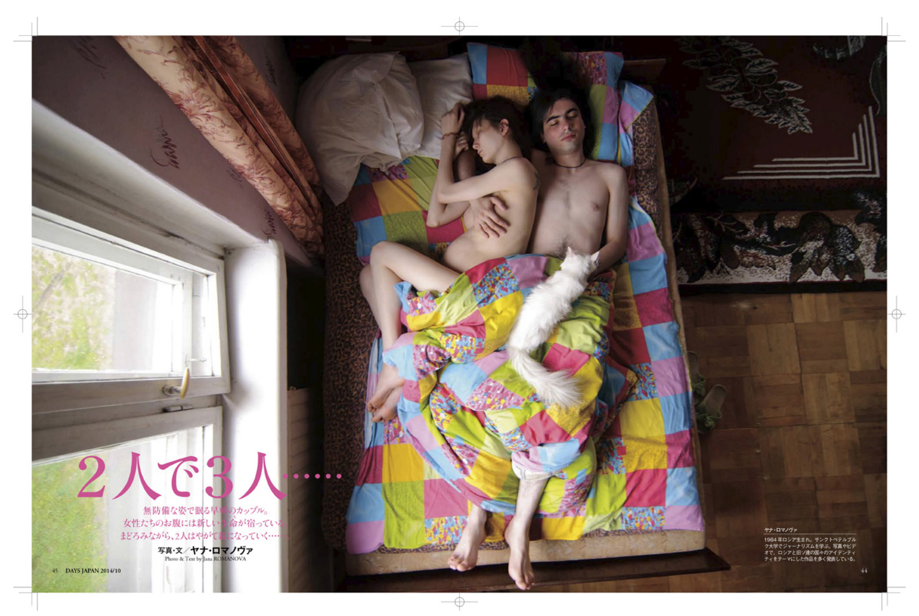
Days Japan, 2014