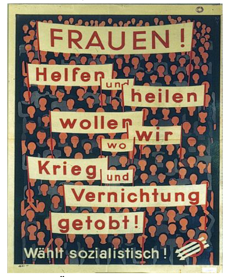
Fig. 2: SPÖ: Frauen! Helfen und heilen wollen wir wo Krieg und Vernichtung getobt!, 1945.

Obviously, women were the sole group targeted by this election poster. This might seem rather uncommon, but makes sense if one looks at the political and economic situation in Austria at that time. In the context of the Austrian elections in 1945, women suddenly represented approximately 2/3 of eligible voters.<sup>19</sup> This marks a change in the role of women in society and politics. It wasn't just the election poster of the Socialist party which addressed women directly, but also those of the other two relevant competing parties (KPÖ<sup>20</sup> and ÖVP<sup>21</sup>). In other words, women were considered a significant factor in this specific situation more than ever.