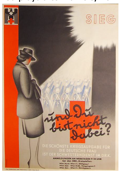
Fig. 1: DRK: Sieg. Und du bist nicht dabei? Die schönste Kriegsaufgabe für die deutsche Frau ist der Schwesterndienst im D.R.K. Waldheim-Eberle, Wien, 1943.

The colours play an important role in emphasizing the distance between the woman and the nurses. Whereas the woman, well-dressed in dark colours, remains in the shadow, the nurses and the word Sieg are depicted in exceptionally bright light compared to the surrounding darkness. Apart from this dark-light contrast, the colour red plays a central role, illuminating the implicated norms applied in Nazi ideology.