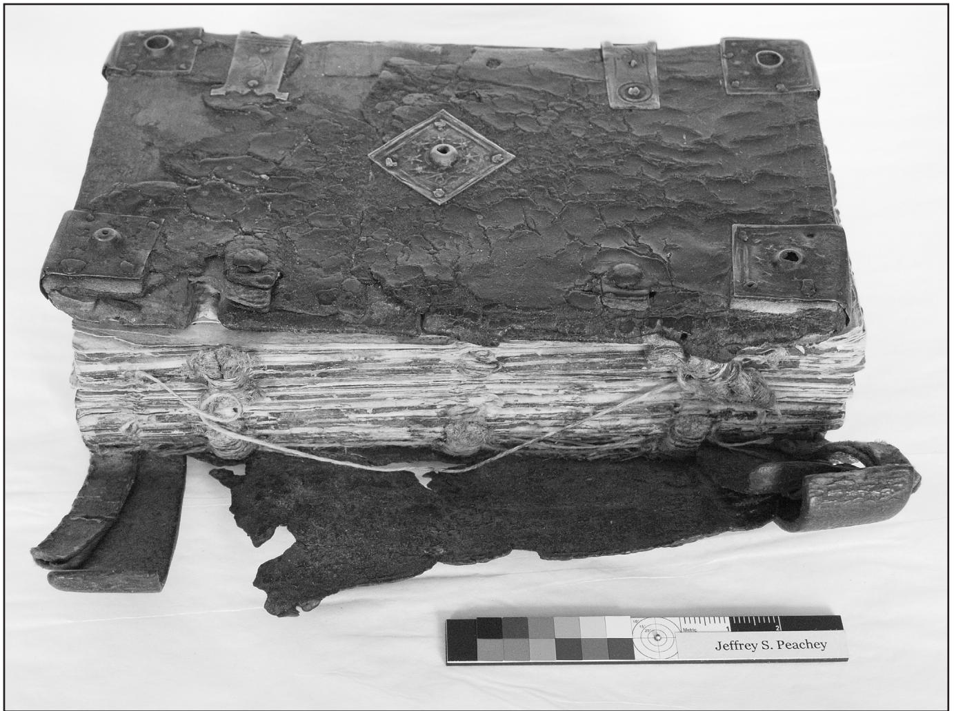
Fig. 1. Condition of the Mennonite Historical Library's 1564 Ausbund before treatment