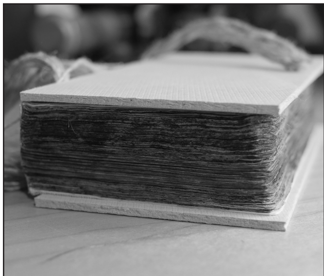
Fig. 5. The textblock during treatment after the new blank pages were added and it was sewn. The boards shown are for temporary protection; the original ones were reused.

Torinoko Gampi and Tengucho) to integrate visually and structurally with the leaves. Almost every leaf needed repair. I also re-pasted extensions where the adhesive had failed. Repairing the leaves was one of the most time-consuming aspects of this entire treatment (fig. 4).