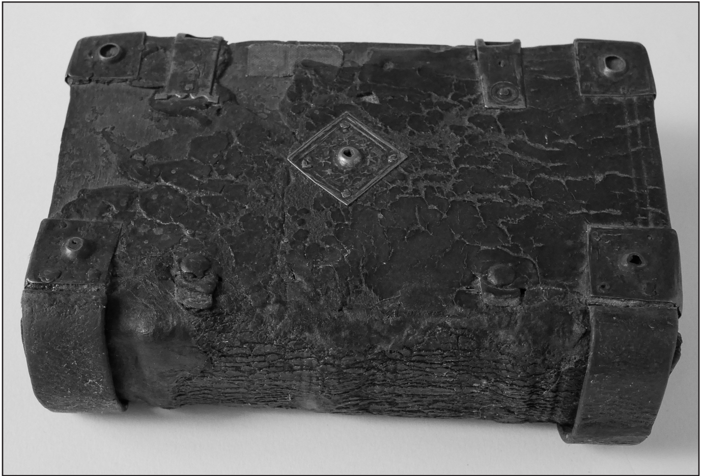
Fig. 6. The spine and front board after conservation treatment

connection to this book even though it is a cornerstone of my own Anabaptist heritage and the treatment itself was uniquely challenging. All books are our shared cultural legacy and, at least for me, an endlessly fascinating technology. Images of pages cannot contextualize a text within a cultural and time-bound era the way the materiality and aura of the physical book does.