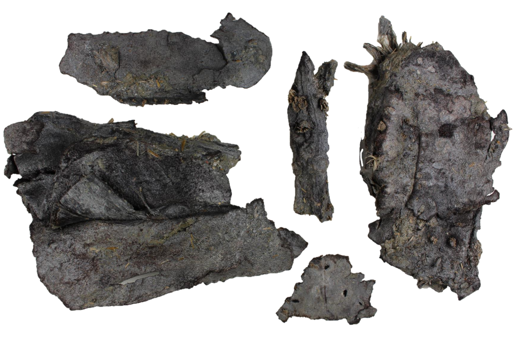
Fig. 2: Desiccated and contaminated leather fragments.

In the course of archaeological excavations vast amounts of organic artefacts sometimes emerge unexpectedly. Typical provenances are watersaturated or underwater sites in coastal regions, but also inland waters and moorlands. These materials are in a worse condition and the recovery and lifting from the protective ground increases degradation processes rapidly. Due to lack of resources (staff, equipment, time), excavation teams cannot always provide adequate first aid measures. In addition, leather artefacts are rarely discovered isolated, they occur very often as bundles or large bulks. These request completely different work-flows regarding documentation, packing and transport. Various guidelines describe the procedure for approaching damp or waterlogged organic artefacts. The most important in post-excavation are stable storage conditions, like packing in airtight boxes or bags to avoid cellular breakdown by desiccation. Cold storage is obligatory. The recruitment of a conservator is mostly suggested. Common conservation methods for waterlogged artefacts include a pre-treatment with polyethylene glycol following by vacuum freezedrying. However, some institutions do not have